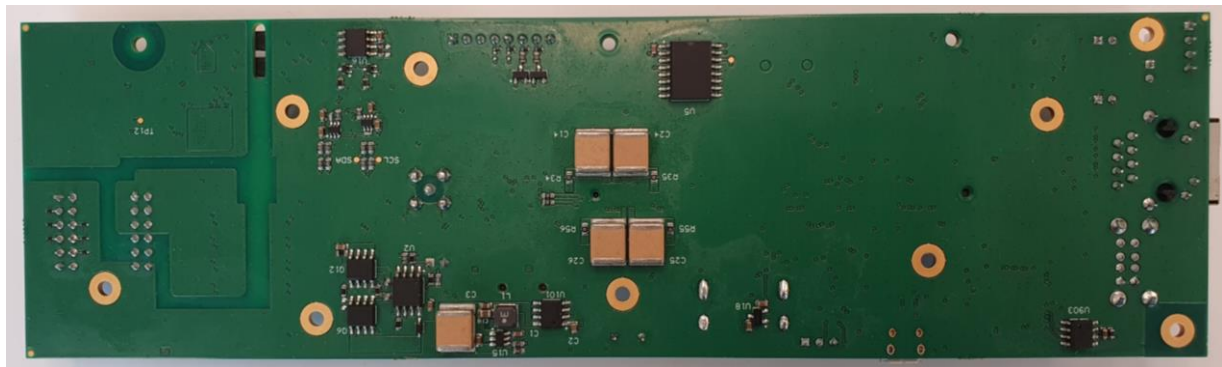
LCS Board – back side