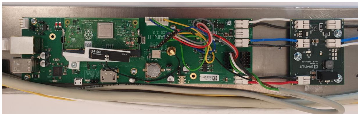
LCS Board fitted with LCS PWR in the Pole, LED / PSU to the right in the picture.