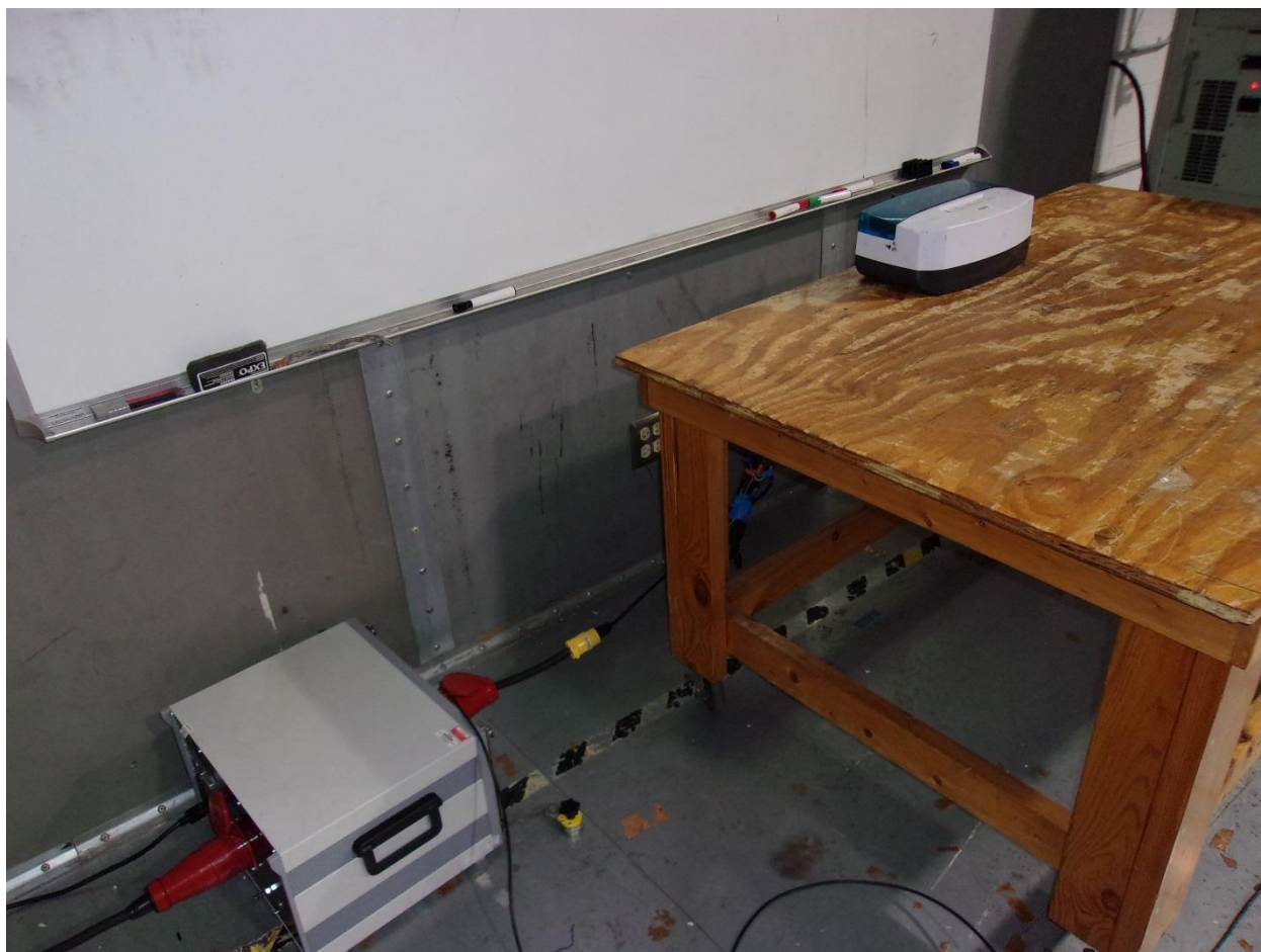
Conducted Emissions on the AC Power Ports