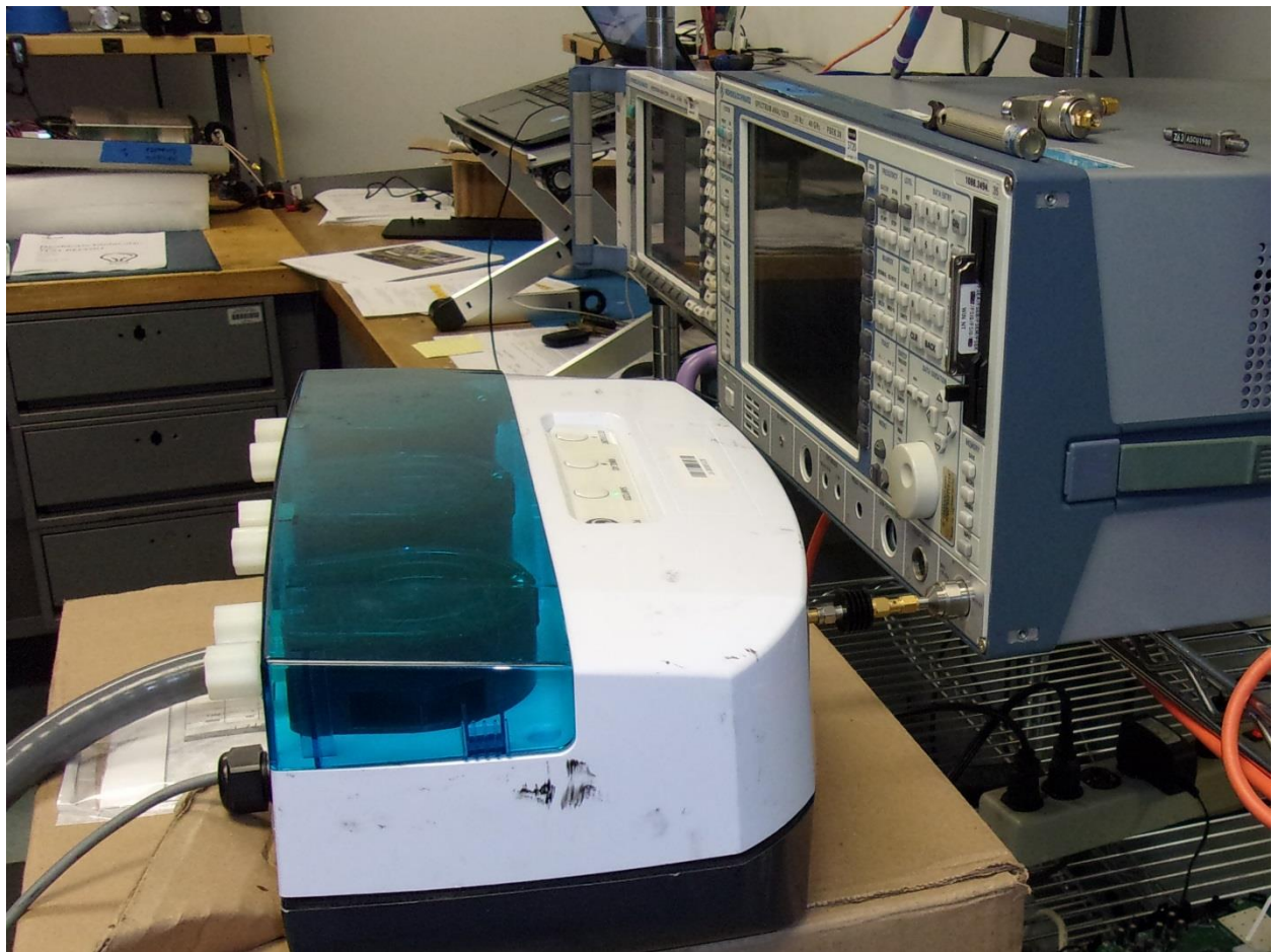
Conducted Antenna Port Measurements