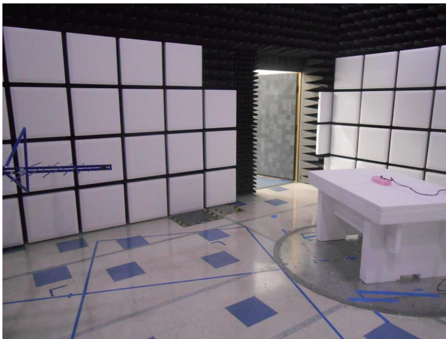
Radiated Emissions 30 – 1000 MHz