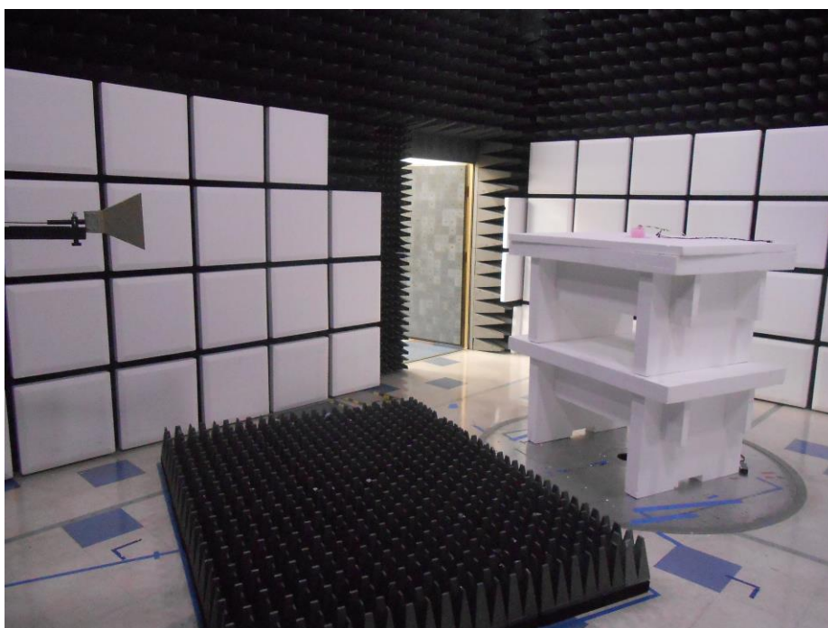
Radiated Emissions 1 – 18 GHz