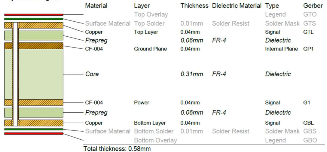
Layer Stack Legend