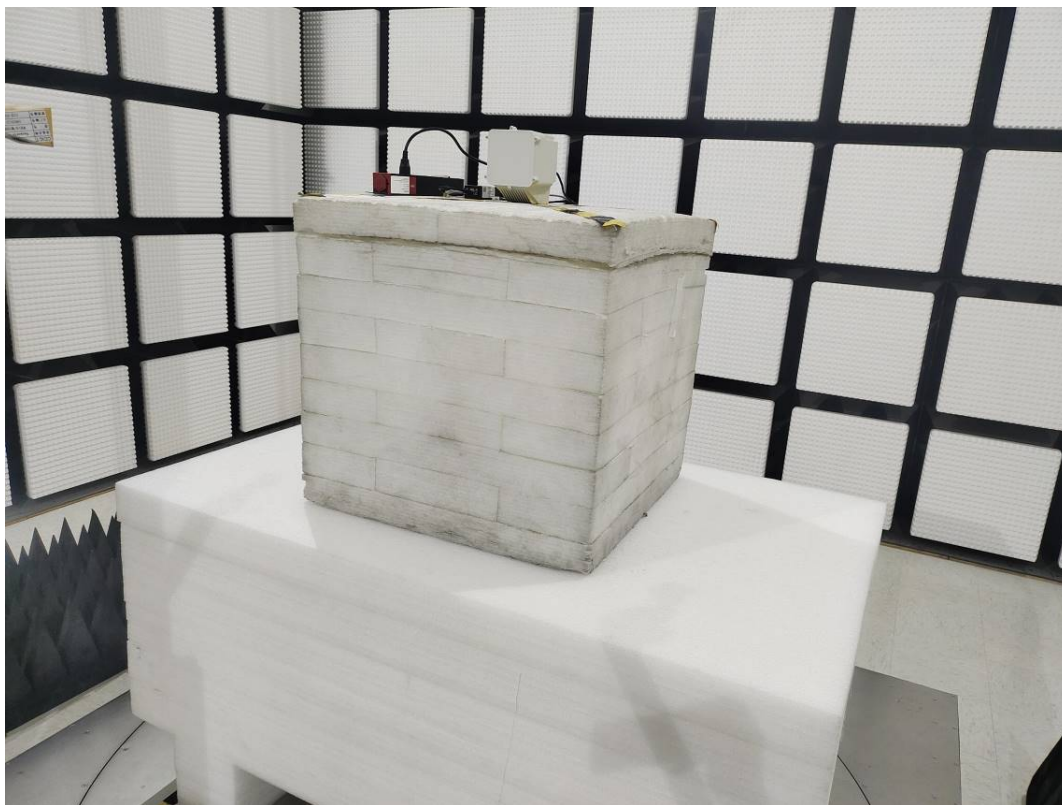
Radiated Emission Above 1GHz View-(60-90GHz)