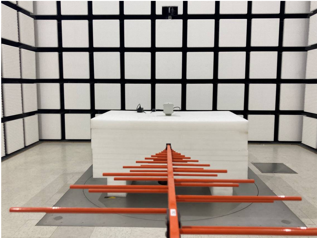
Radiated Emission Above 1GHz View-(1-18GHz)