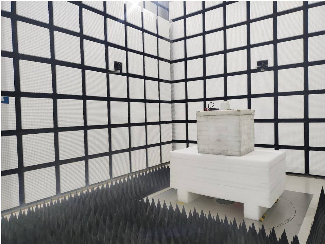
Radiated Emission Above 1GHz View-(26.5-40G)