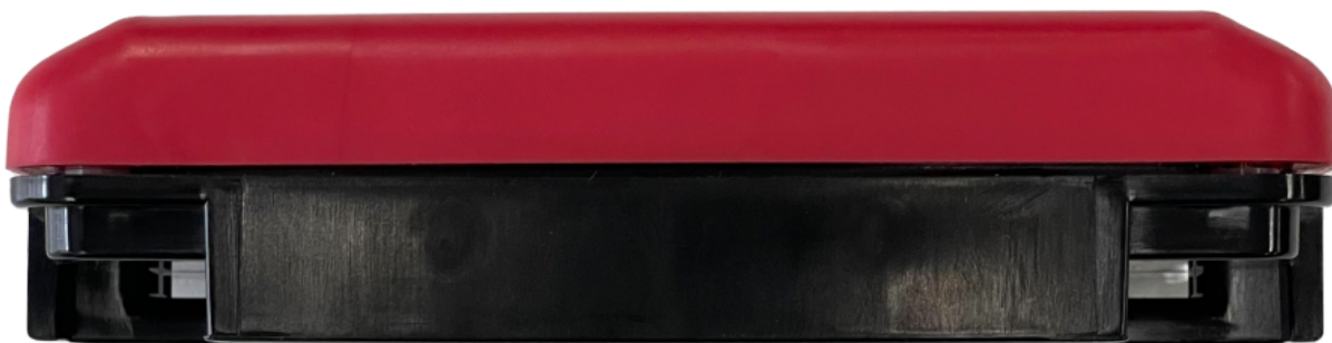
Figure 4. Front View