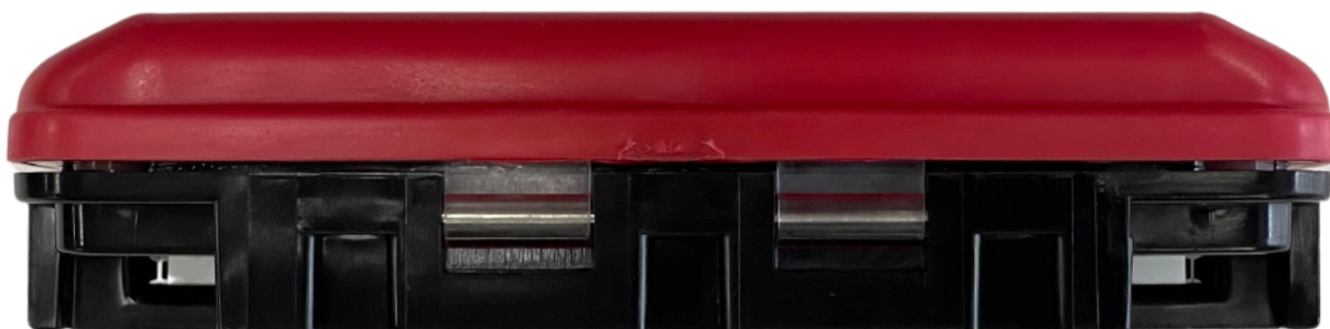
Figure 5. Back View