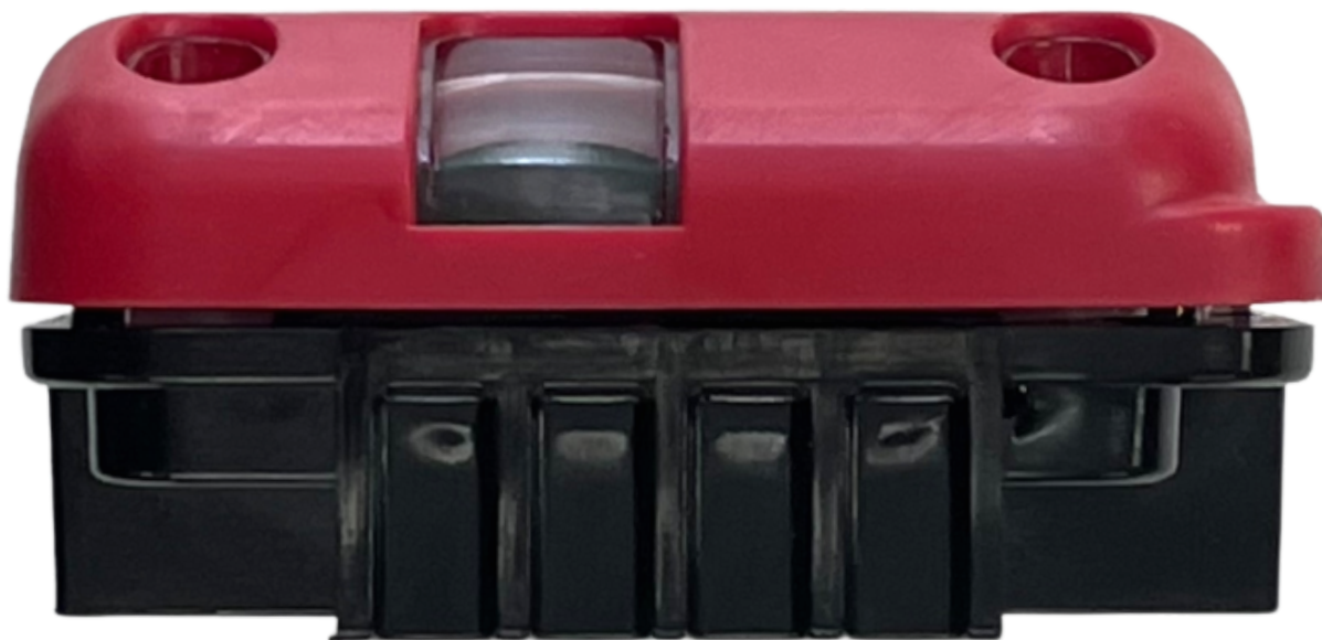
Figure 7. Right View