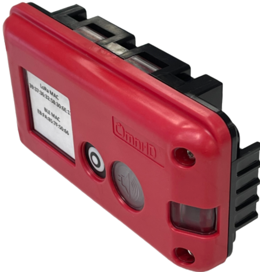
Figure 1. Isometric View