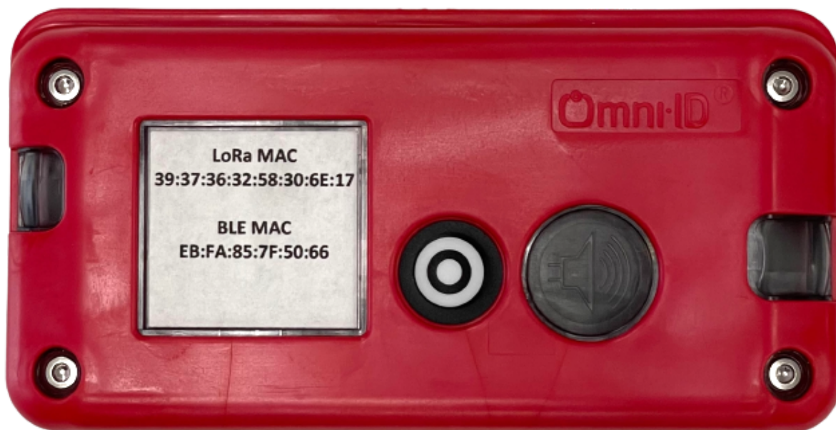
Figure 2. Top View