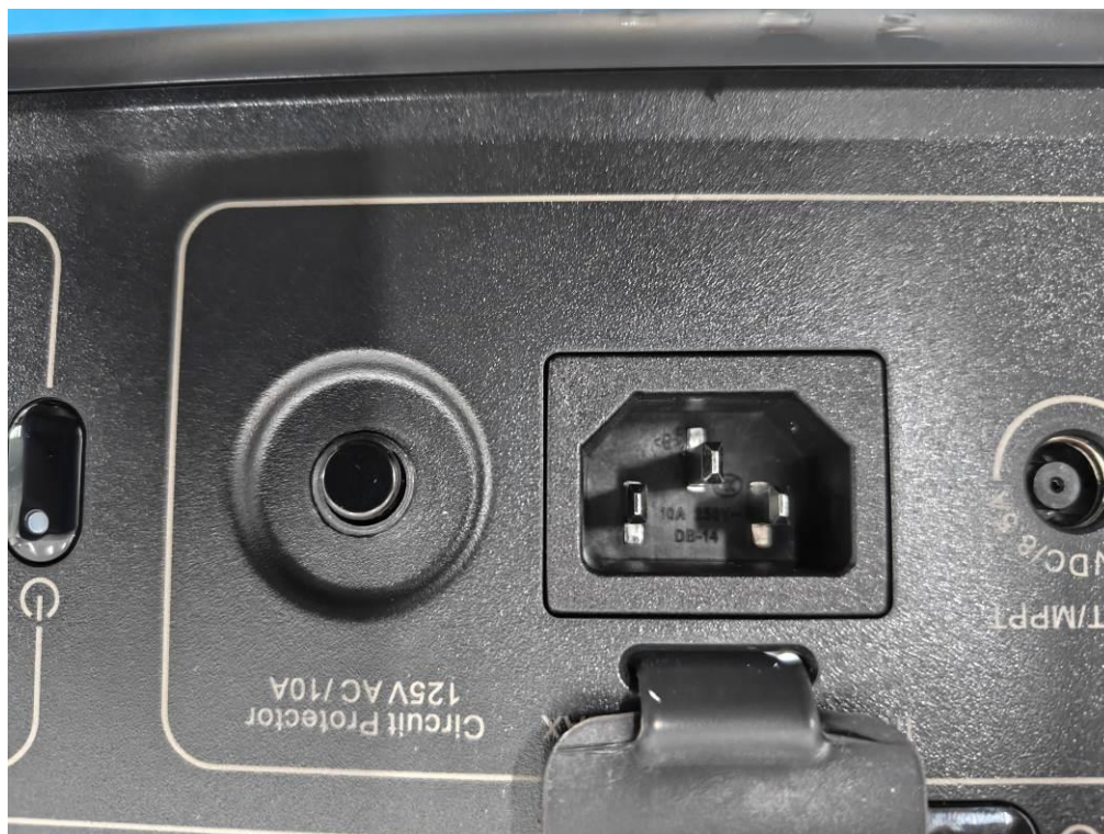
PORT VIEW-2 OF EUT