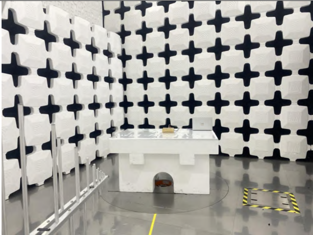
Radiated Emission Above 1G