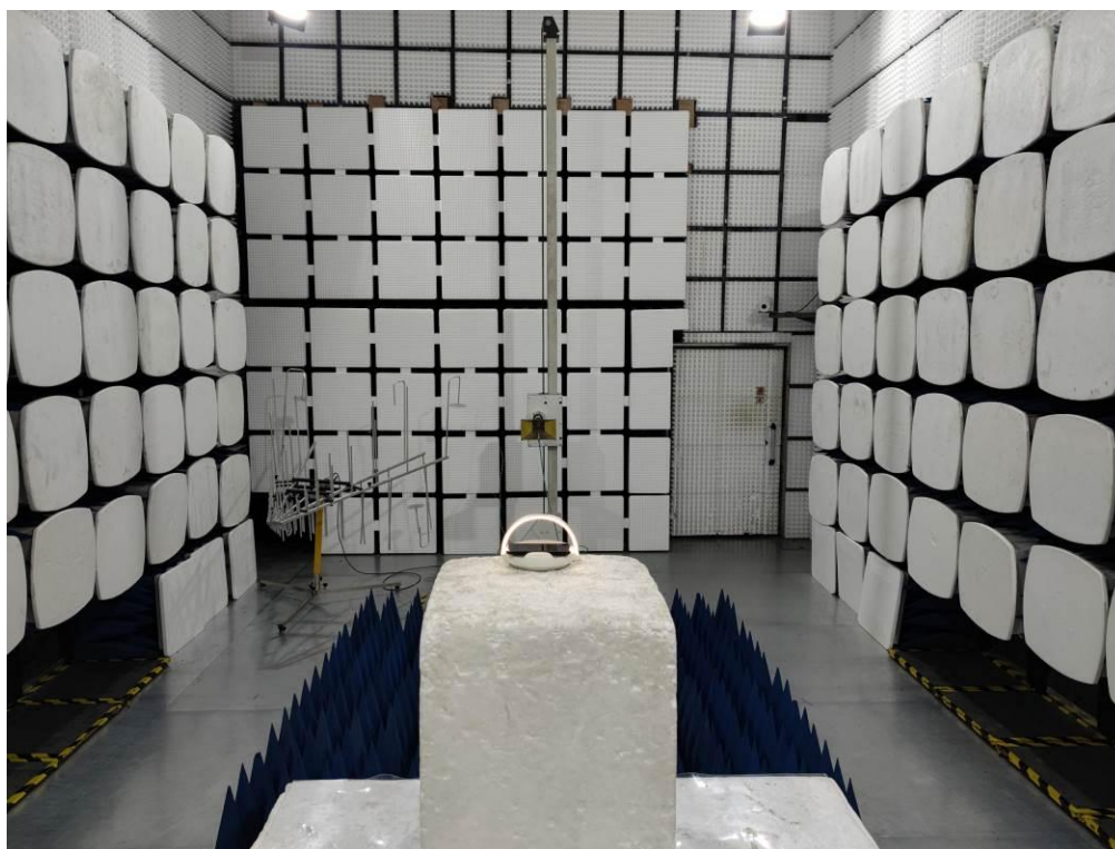
Spurious Emission above 1GHz