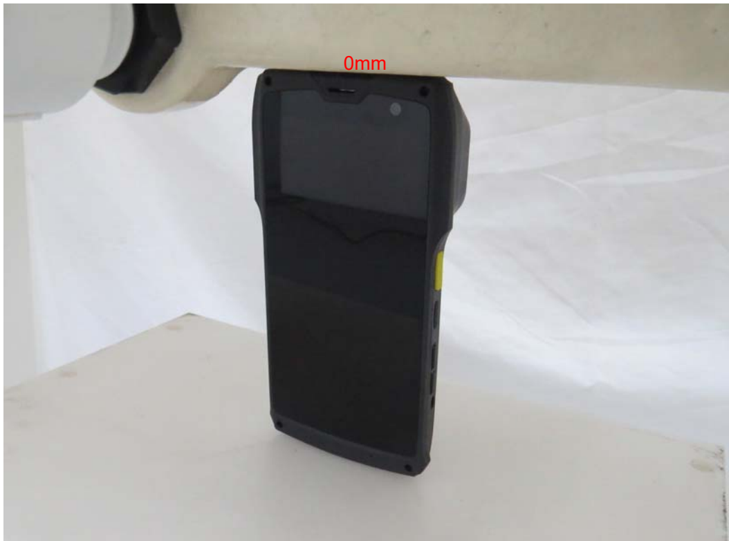
Picture 7: Top Side, the distance from handset to the bottom of the Phantom is 0mm