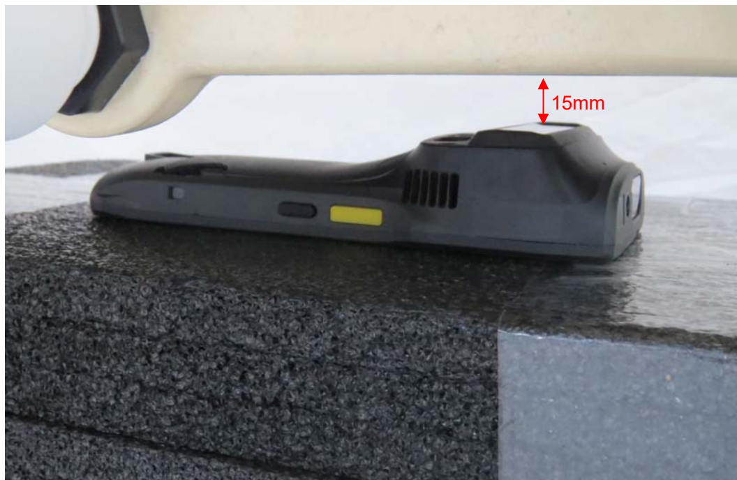
Picture 1: Back Side, the distance from handset to the bottom of the Phantom is 15mm