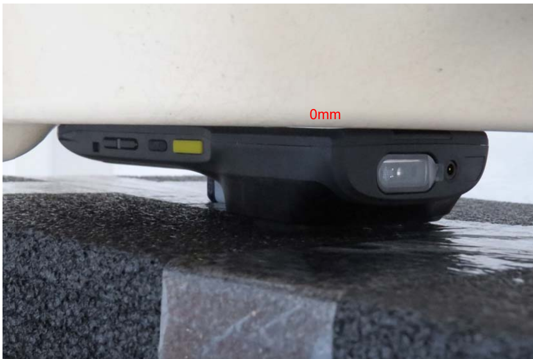
Picture 4: Front Side, the distance from handset to the bottom of the Phantom is 0mm