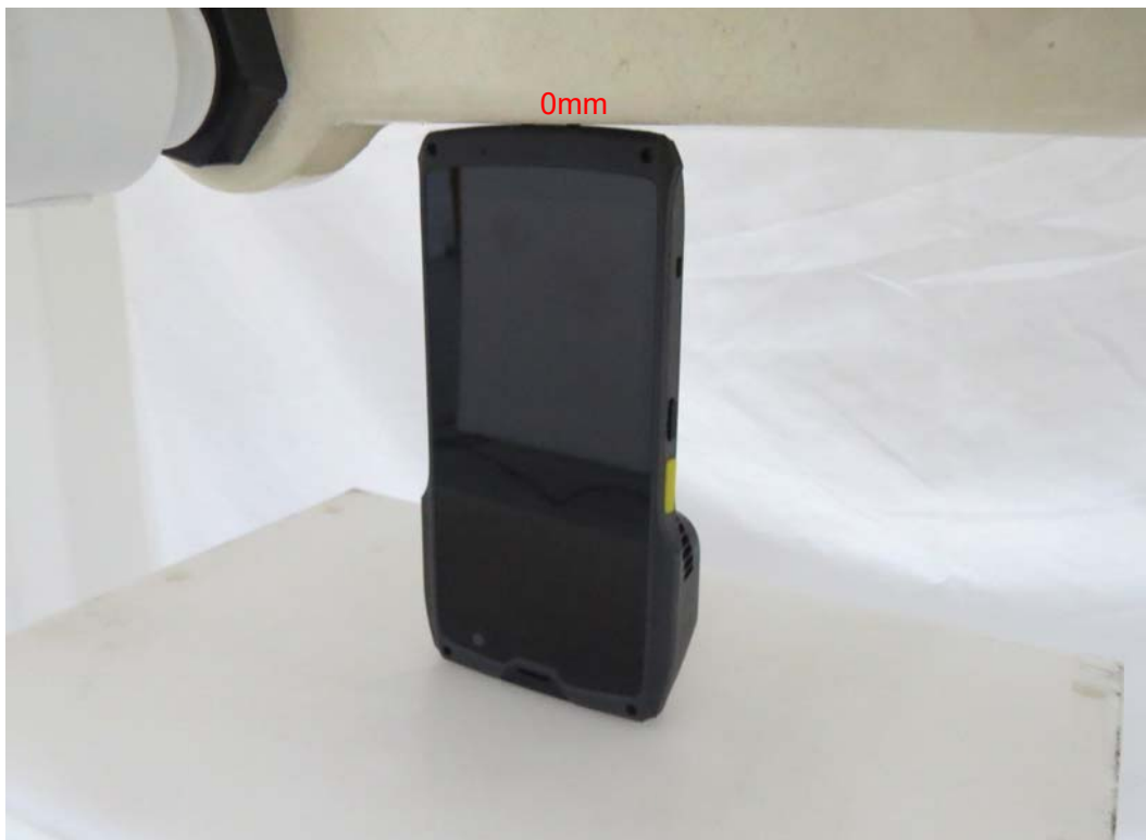
Picture 8: Bottom Edge, the distance from handset to the bottom of the Phantom is 0mm