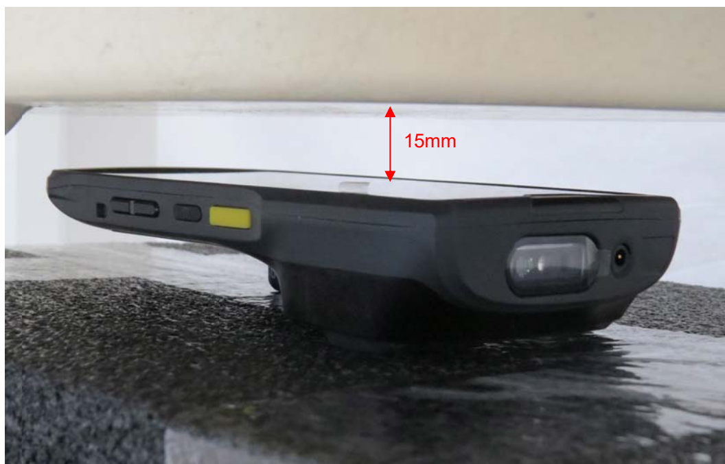
Picture 2: Front Side, the distance from handset to the bottom of the Phantom is 15mm