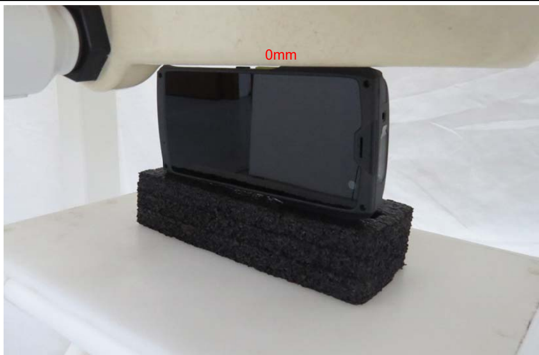
Picture 5: Left Side, the distance from handset to the bottom of the Phantom is 0mm