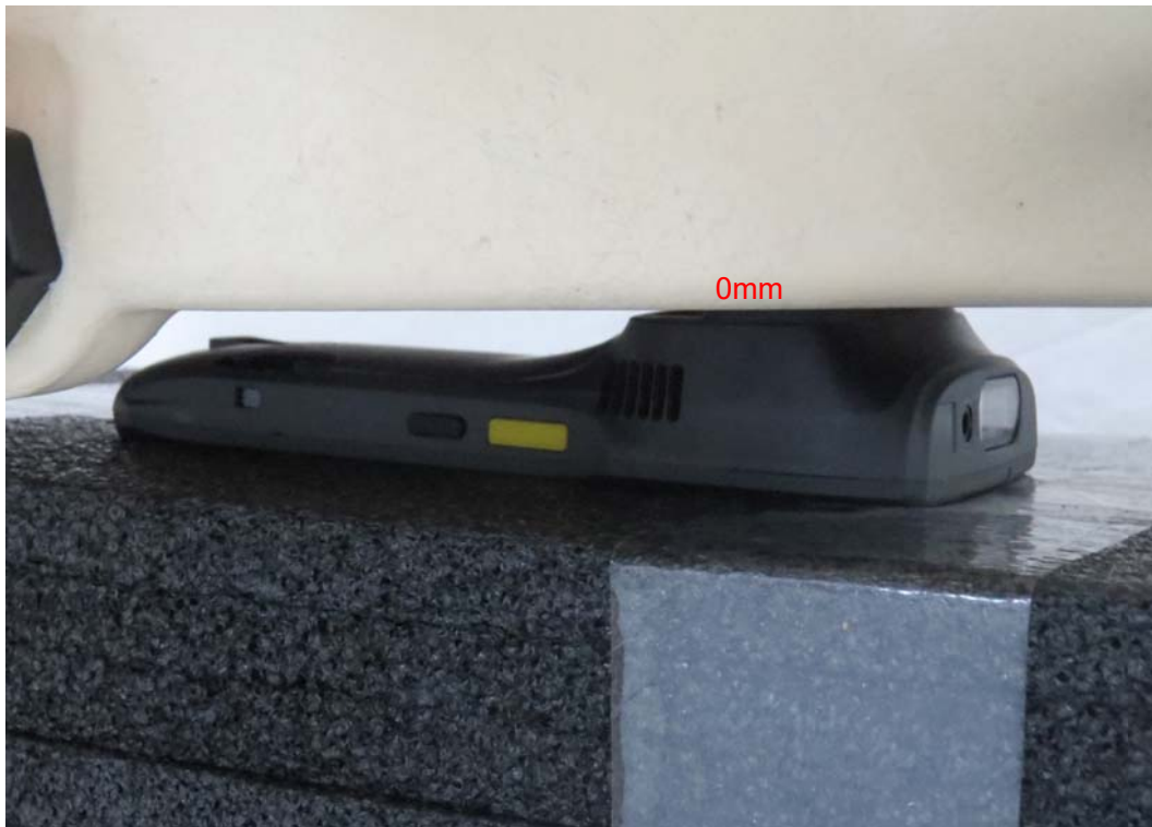
Picture 3: Back Side, the distance from handset to the bottom of the Phantom is 0mm