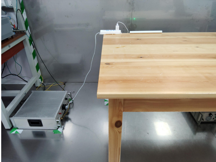
Radiated Spurious Emission (above 1GHz)