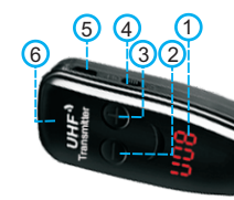
Figure 3: Transmitter (with display)