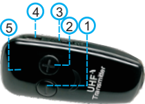
Figure 1: Transmitter (without display)