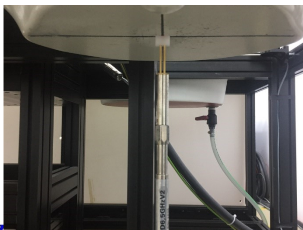
System Performance Check Setup