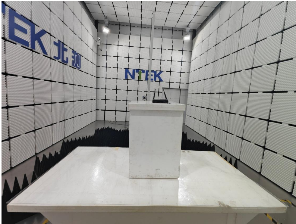
Conducted Measurement Photos