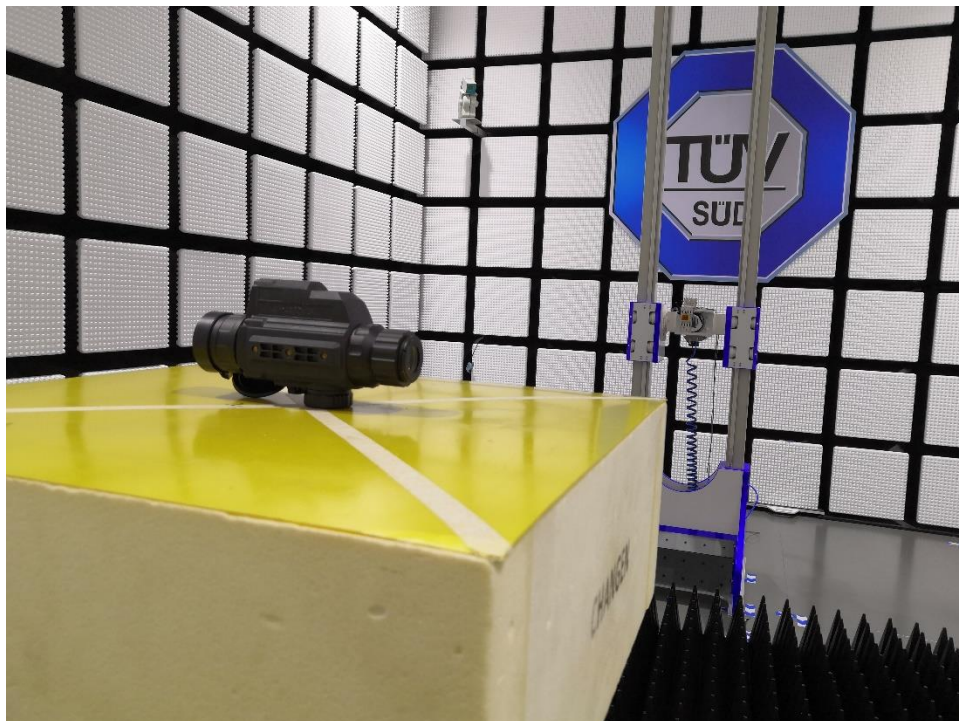
Radiated Spurious emission Above 18 GHz