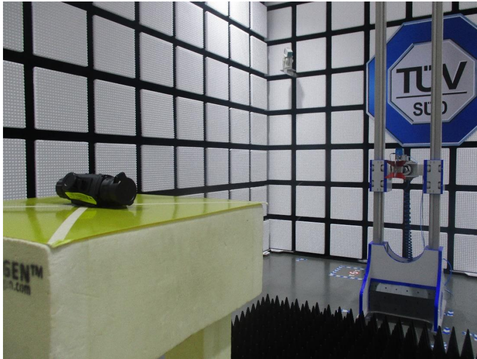
Radiated Spurious emission 1GHz - 18 GHz