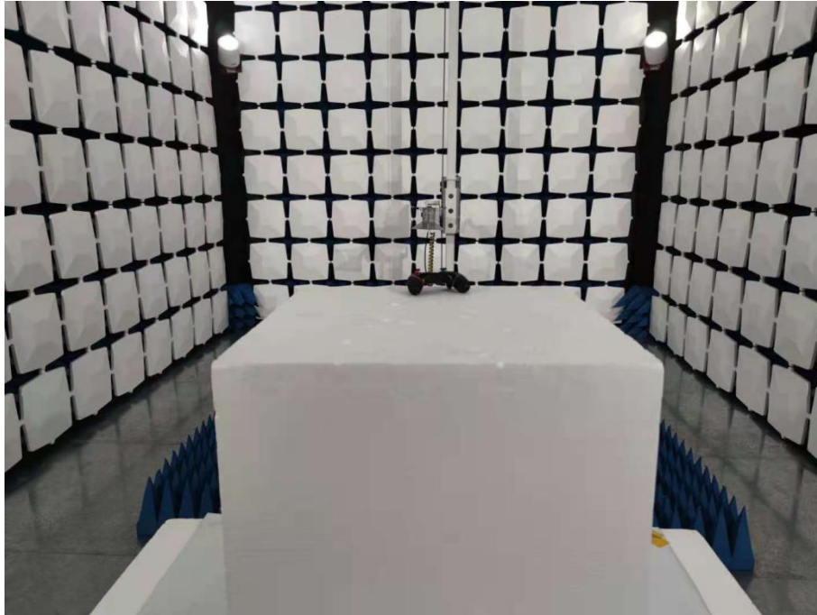
Below 1GHz for radiated emission test setup