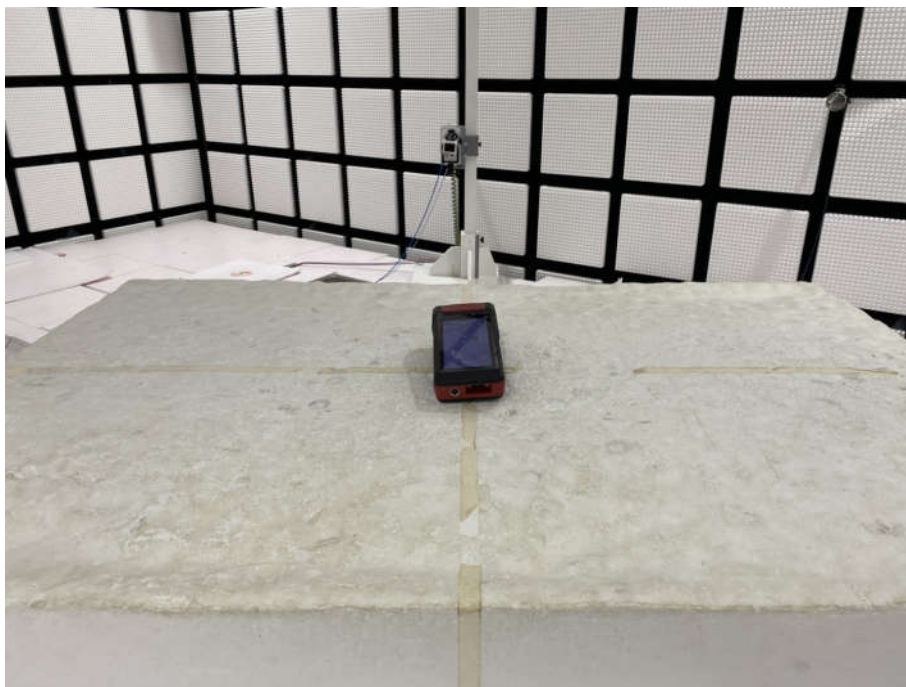
Radiated spurious emission Test Setup-3(18-30 GHz)