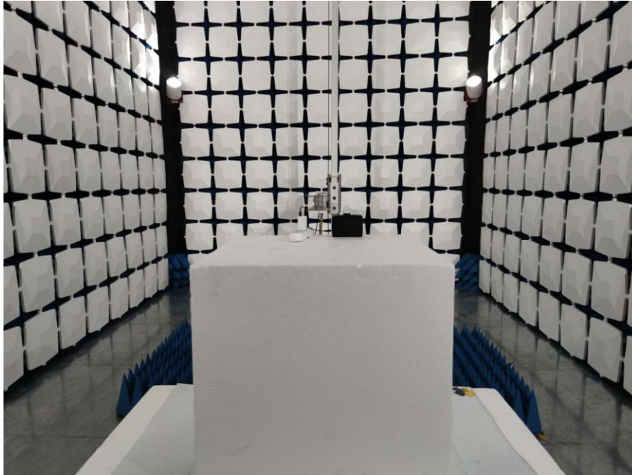
Above 1GHz for radiated emission test setup