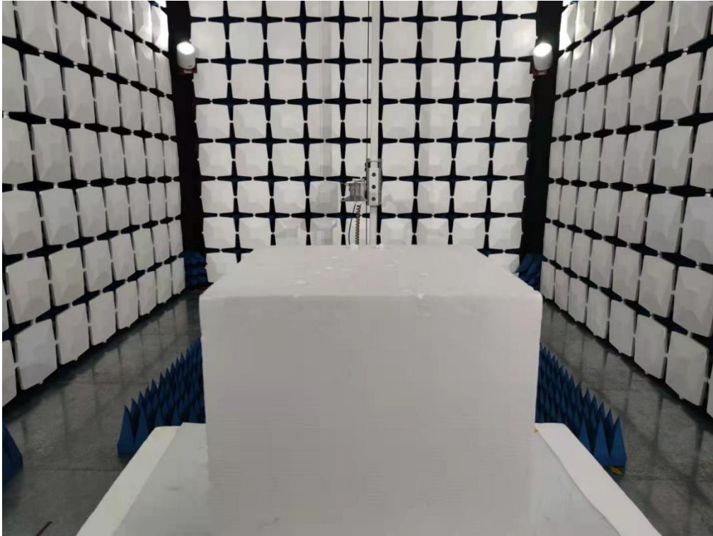
Below 1GHz for radiated emission test setup