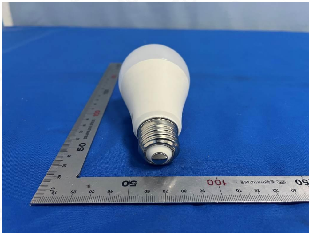
BACK VIEW OF EUT