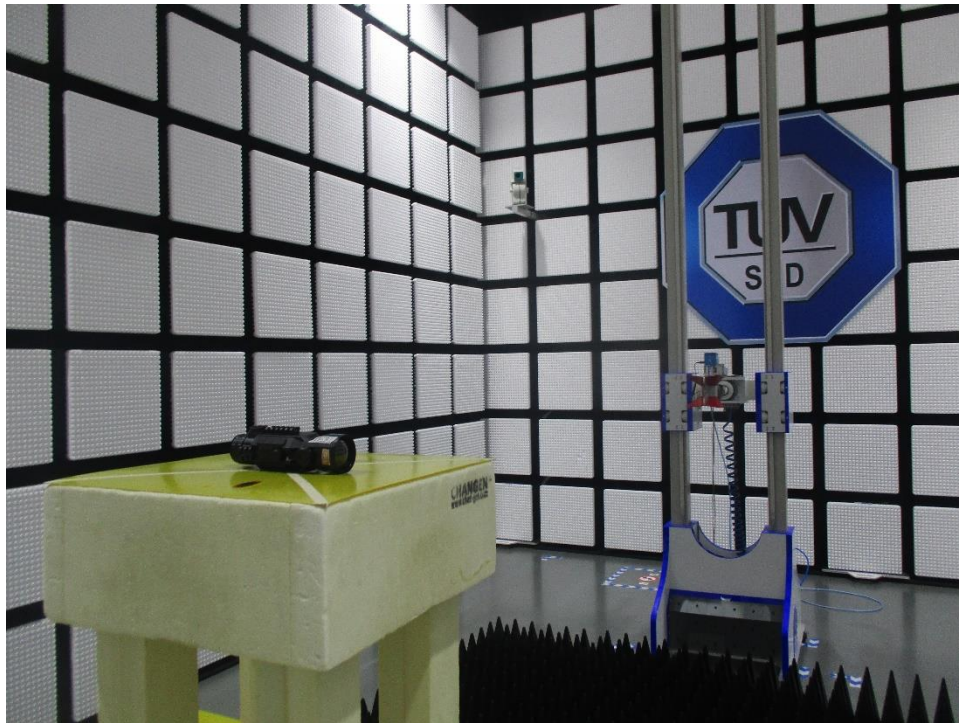
Radiated Spurious emission 1GHz - 18 GHz