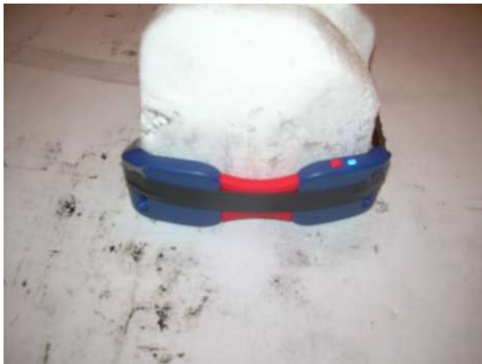
Photograph 6: On Edge Configuration