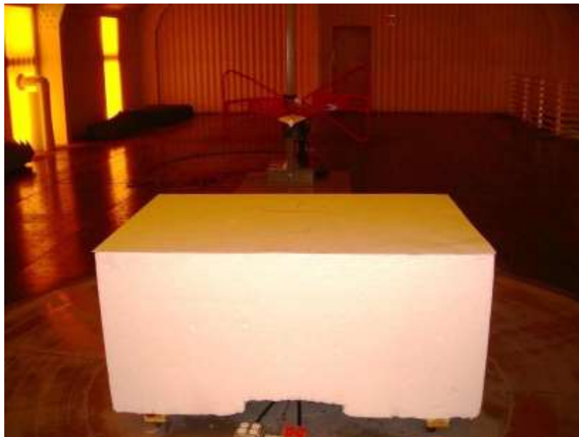
Photograph 9: Reference Photo of Test Setup for Emissions From 30 MHz to 1000 MHz