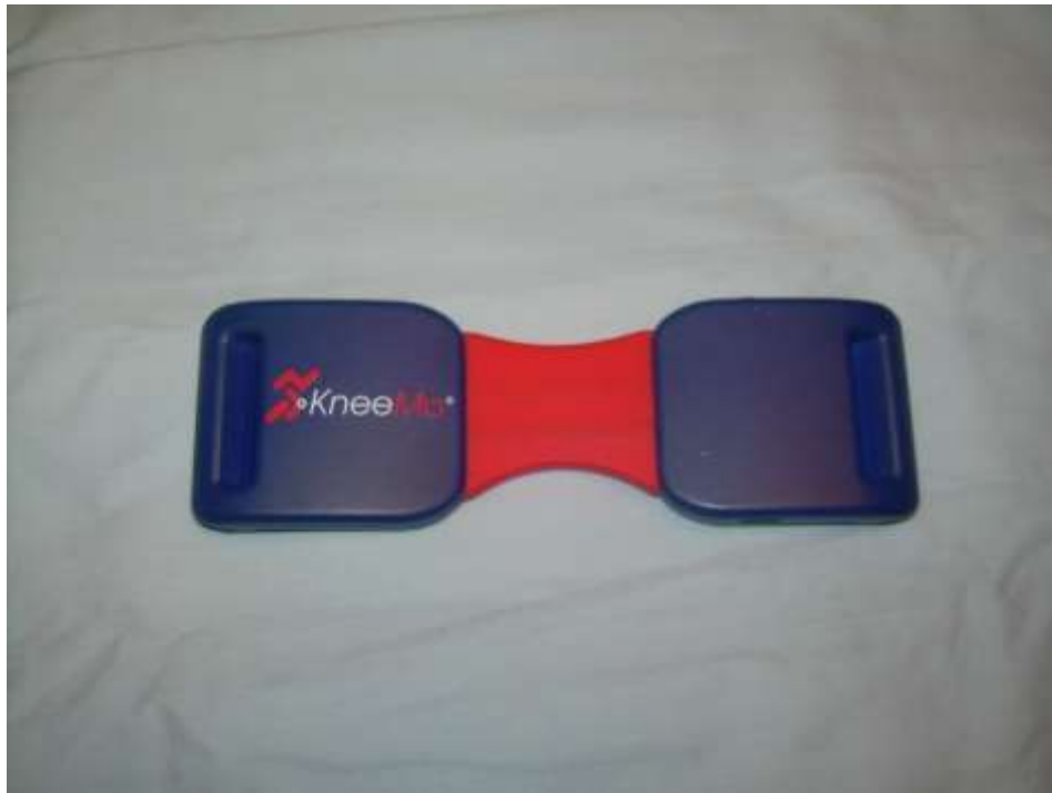
Photograph 5: Flat Configuration