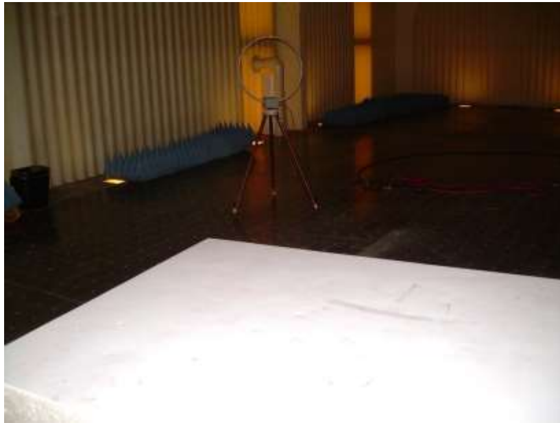
Photograph 8: Reference Photo of Test Setup for Emissions Below 30 MHz