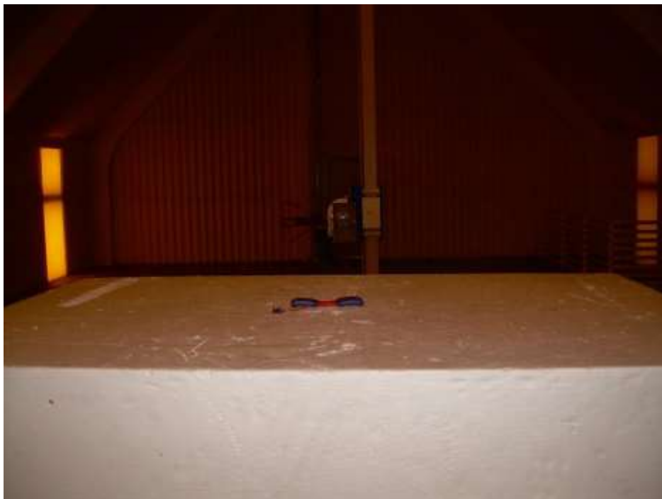
Photograph 4: Back View Radiated Emissions Worst Case – Above 1000 MHz Configuration