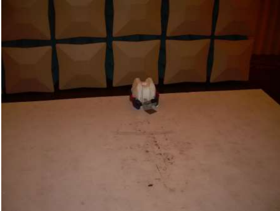
Photograph 1: Front View Radiated Emissions, Worst Case, Below 1000 MHz