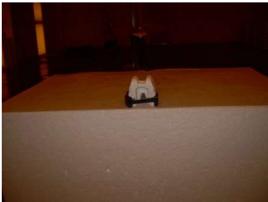
Photograph 2: Back View Radiated Emissions Worst Case, Below 1000 MHz