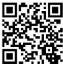
HIKMICRO Viewer Android

You can use HIKMICRO Analyzer to analyze pictures offline, and generate a report. Or you can scan the QR code below to install the HIKMICRO Viewer App, and then you can view live view, capture, and recording on your phone.