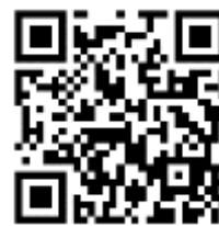
HIKMICRO Viewer iOS