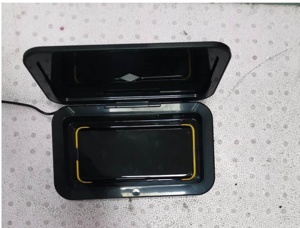
Radiated Emission Below 1 GHz