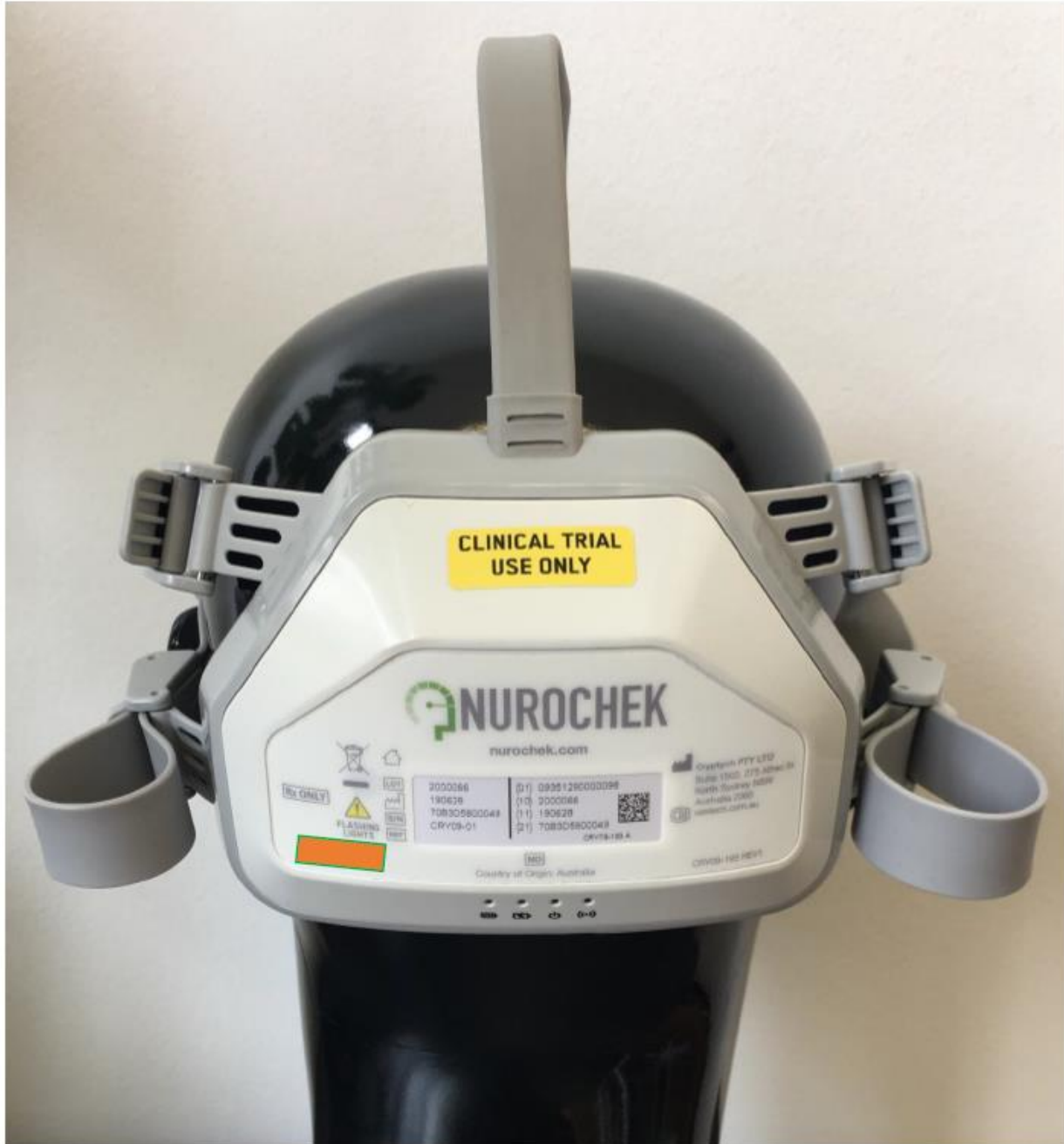
Figure 3. Mannequin demonstration head with Nurochek headset (HS01-001). The predicted area in which the FCC ID will be placed on the devices major label (HS01-086) has been highlighted by an orange rectangle.