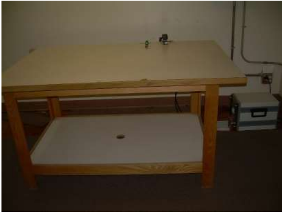
Photograph 7: Front View Conducted Emissions, Worst-Case Configuration