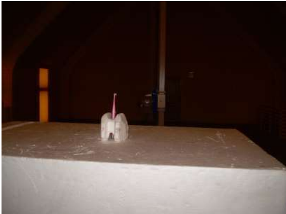
Photograph 6: Vertical Configuration