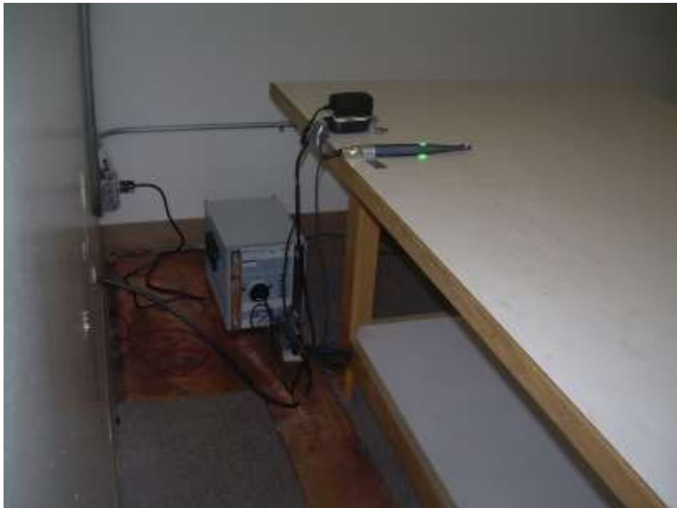
Photograph 8: Back View Conducted Emissions, Worst-Case Configuration