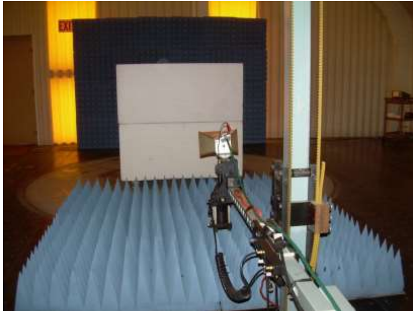
Photograph 11: Reference Photo of Test Setup for Emissions Above 1000 MHz