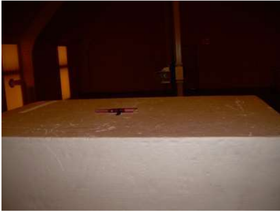
Photograph 5: On Edge Configuration