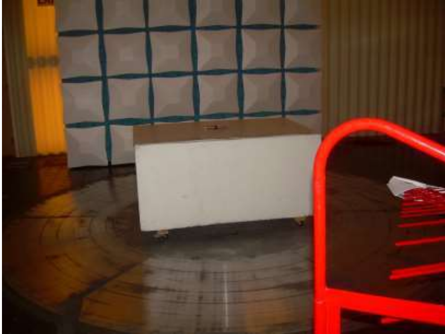
Photograph 1: Front View Radiated Emissions, Battery Powered, Flat Configuration, Below 1000 MHz