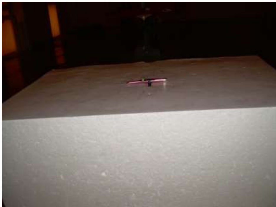
Photograph 4: Flat Configuration