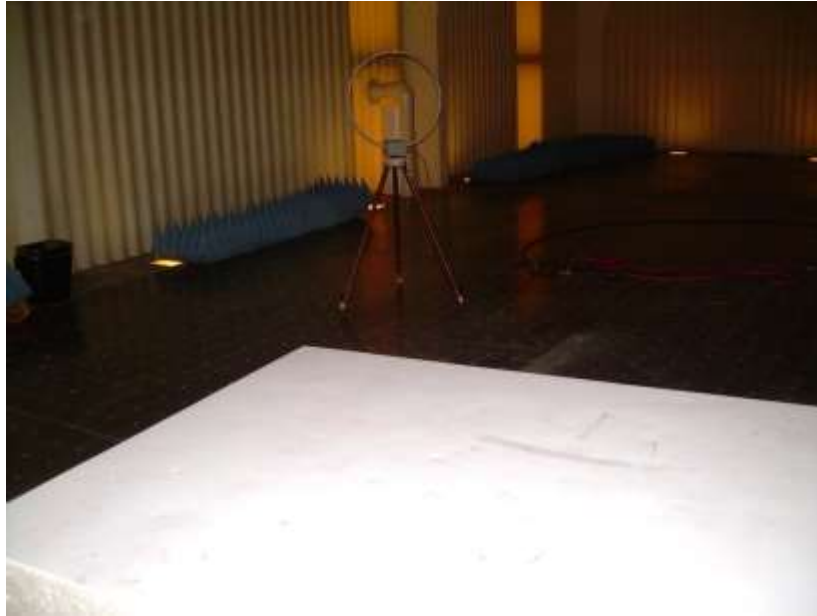
Photograph 9: Reference Photo of Test Setup for Emissions Below 30 MHz