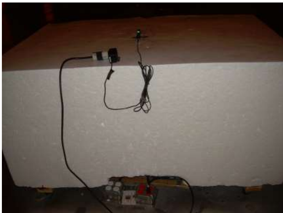
Photograph 2: Back View Radiated Emissions AC Mains Powered Flat Configuration, Below 1000 MHz