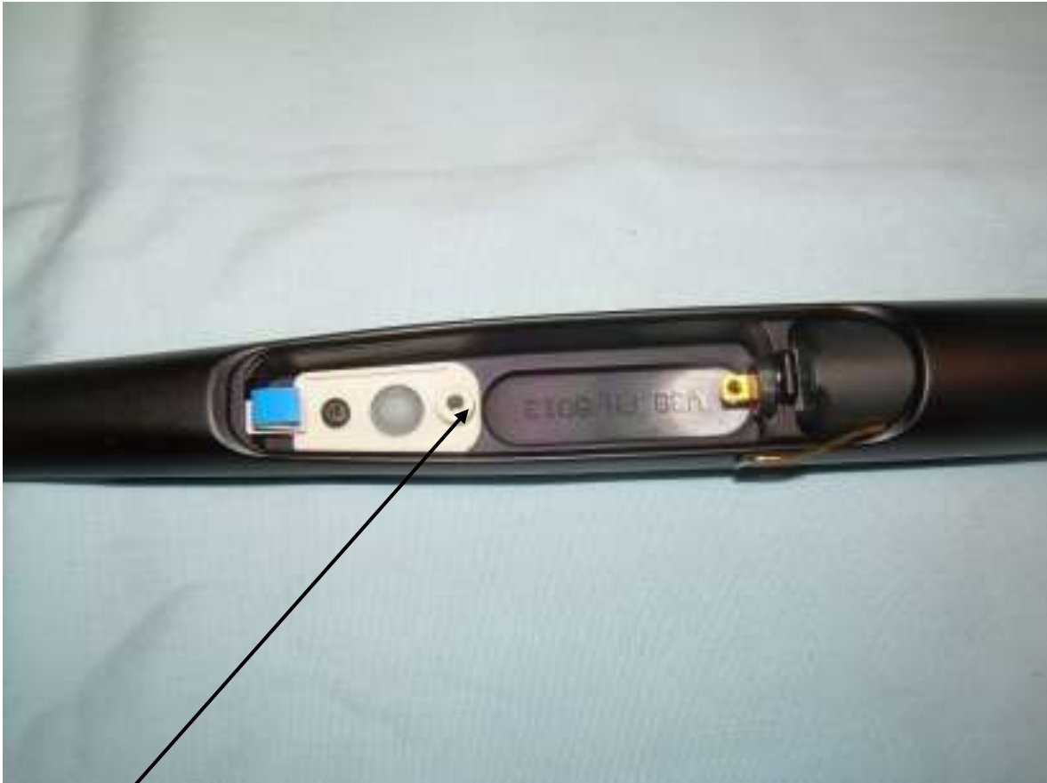
Photograph 3 – Location of PCB in Housing