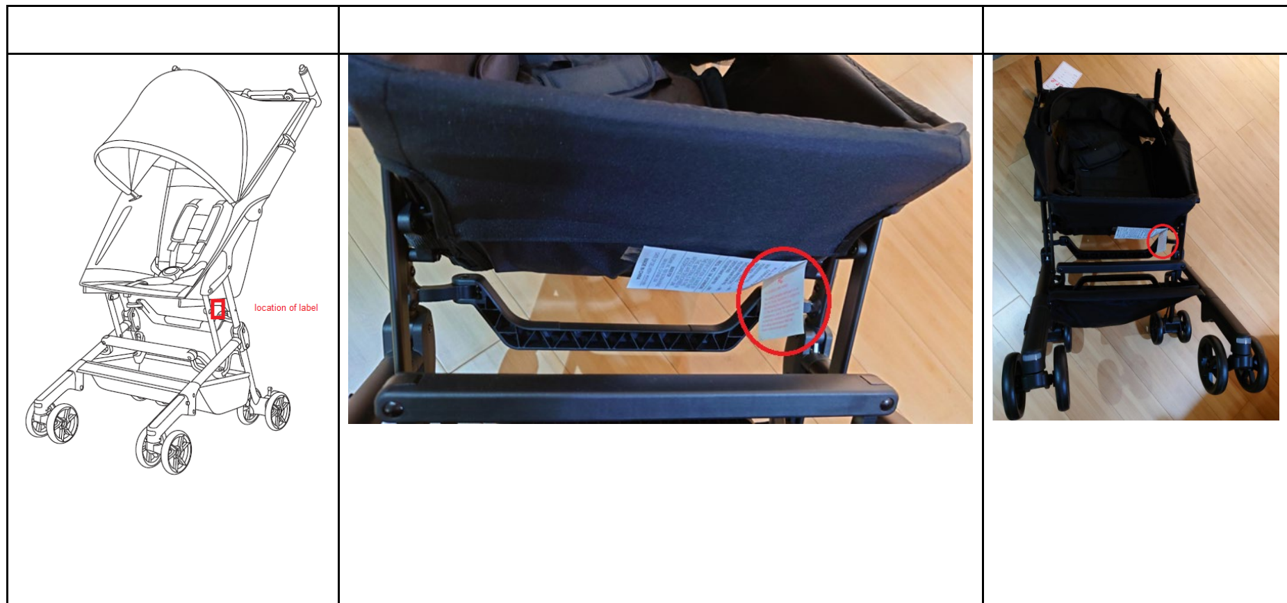
The location of FCC logo