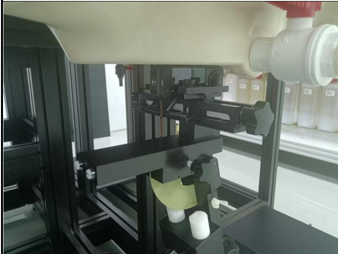
Left Side of EUT with 0 cm Gap