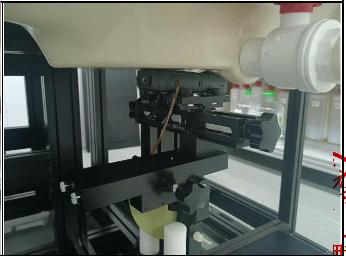
Rear Face of EUT with 0 cm Gap