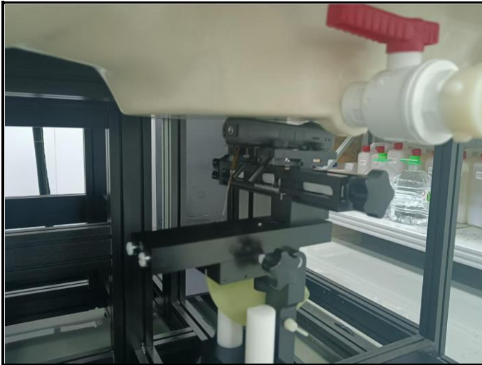
Front Face of EUT with 0 cm Gap