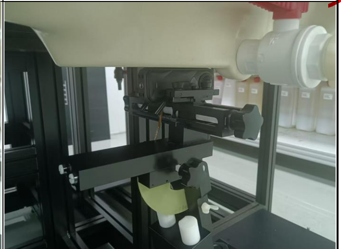
Right Side of EUT with 0 cm Gap