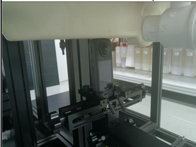
Top Side of EUT with 0 cm Gap