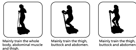
Mainly train the whole body, abdominal muscle and thigh; Mainly train the thigh, buttock and abdomen; Mainly train the thigh, shank, buttock and abdomen.