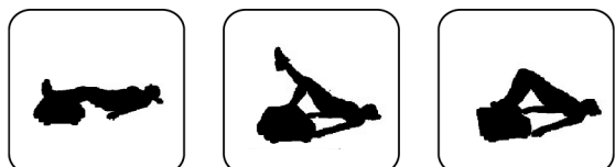
Mainly train the shank and thigh; Mainly train the shank, back, pelvis, buttock, abdominal muscles and thigh; Mainly train the shank, back, pelvis, buttock, abdominal muscles and thigh.