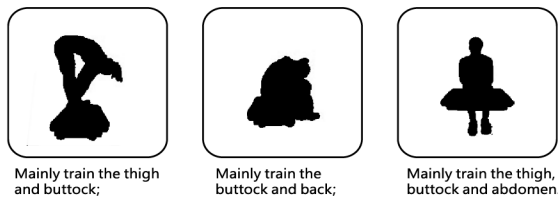
Mainly train the thigh and buttock; Mainly train the buttock and back; Mainly train the thigh, buttock and abdomen.