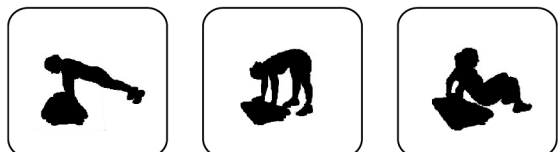
Mainly train the arm, abdominal muscles, shoulder and back; Mainly train the arm, shoulder and back; Mainly train the hands, chest and abdominal muscles.