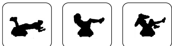
Mainly train the thigh, abdominal muscles and back; Mainly train the buttock, thigh and abdominal muscles; Mainly train the buttock, thigh and abdominal muscles.