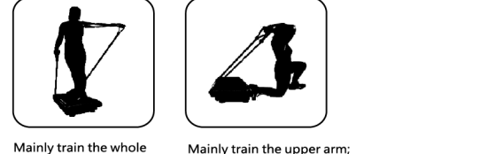
Mainly train the whole body, flank and thigh; Mainly train the upper arm;