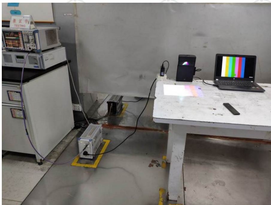
Conducted Emissions Test Setup