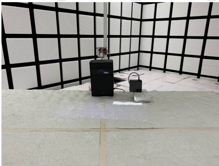
Radiated spurious emission Test Setup-3(Above 1GHz)