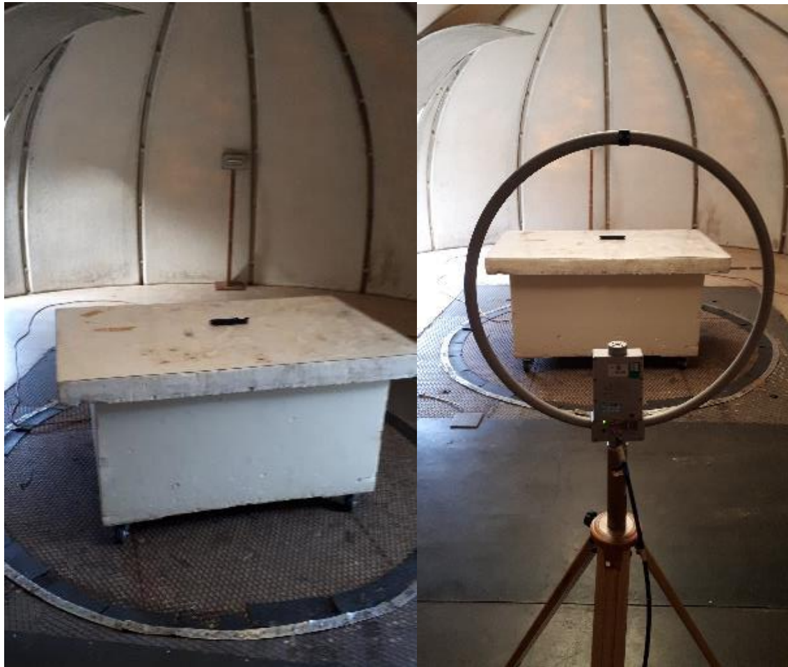
Unwanted Emission in restricted frequency bands between 30MHz & 1GHz