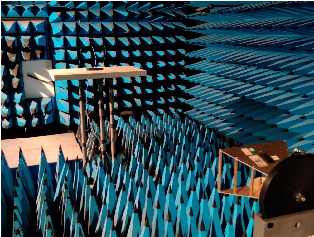
Unwanted Emission in restricted frequency bands above 1GHz