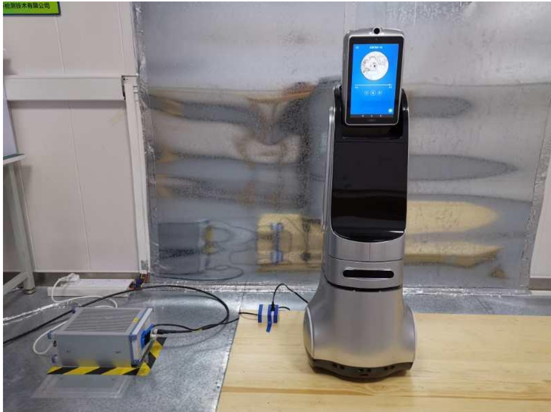
Conducted Emission test setup