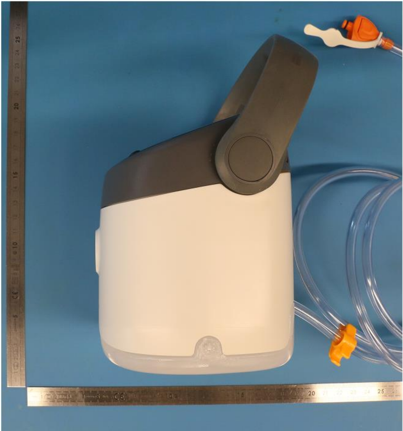
5- Device with Canister attached. Right side view