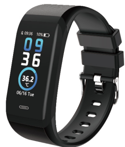
Please read this user manual carefully before use

In order to ensure pairing of devices successfully, the mobile phone should be kept close with the device.