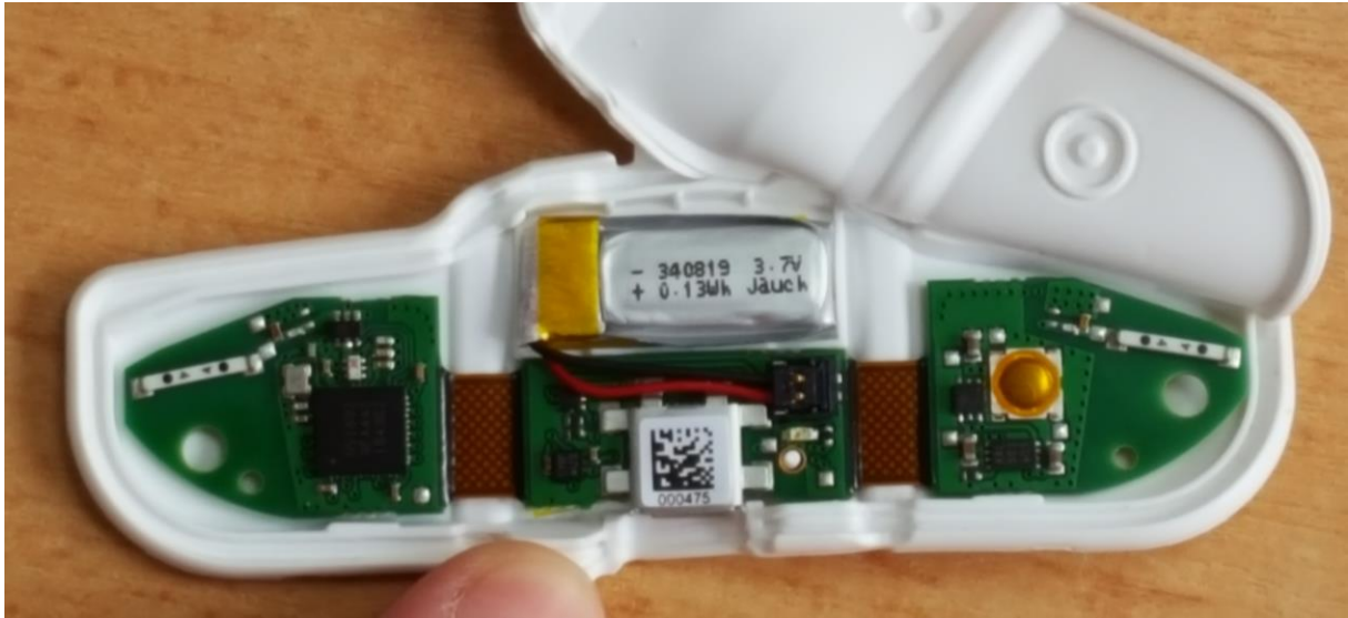
PCBA integrated within product