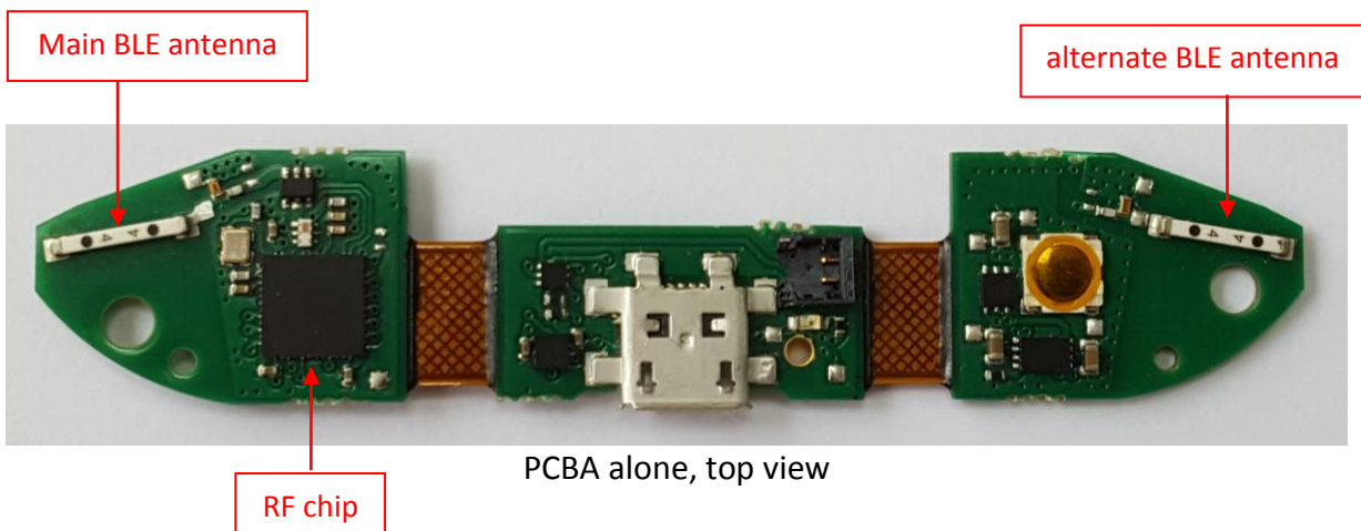
PCBA alone, top view