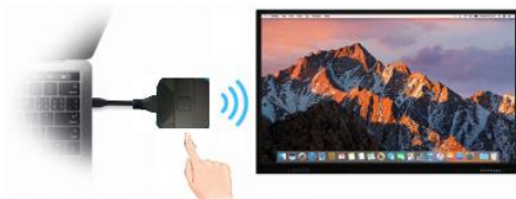
Figure 4. Open the wireless projection screen

LED indicates long and bright aperture: it indicates that the wireless screen transmitter is in the ready state and can transmit the screen at any time; At this time, press the wireless screen transmitter button to achieve the screen function.