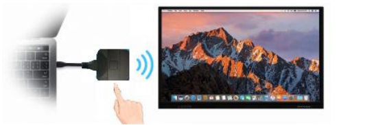
Figure 8 open the wireless projection screen

LED indicates long and bright aperture: it indicates that the wireless screen transmitter is in the ready state and can transmit the screen at any time;At this time, press the wireless screen transmitter button to achieve the screen function.