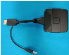
Figure 1 appearance of wireless projector and receiving box (when used in conjunction with the conference tablet, all functions can be achieved by wireless projector only, no receiving box is needed)

The product adopts advanced drive free design, the access to the computer can automatically identify the system, automatically install the application, and start the application. Do not need tedious operation, can complete a key screen.The wireless screen transmitter can also receive touch feedback from the receiving end, feedback the touch operation to the PC, and realize the touch back function.