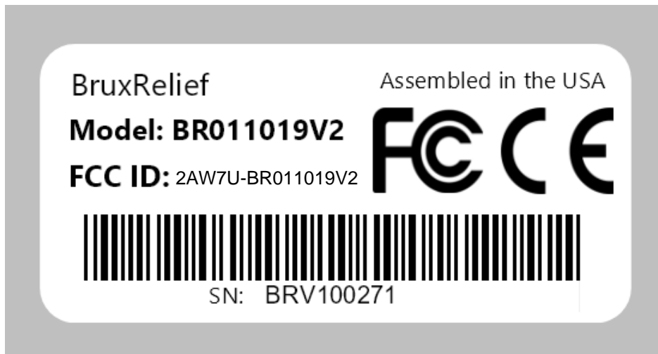
Figure 1: Certification Label