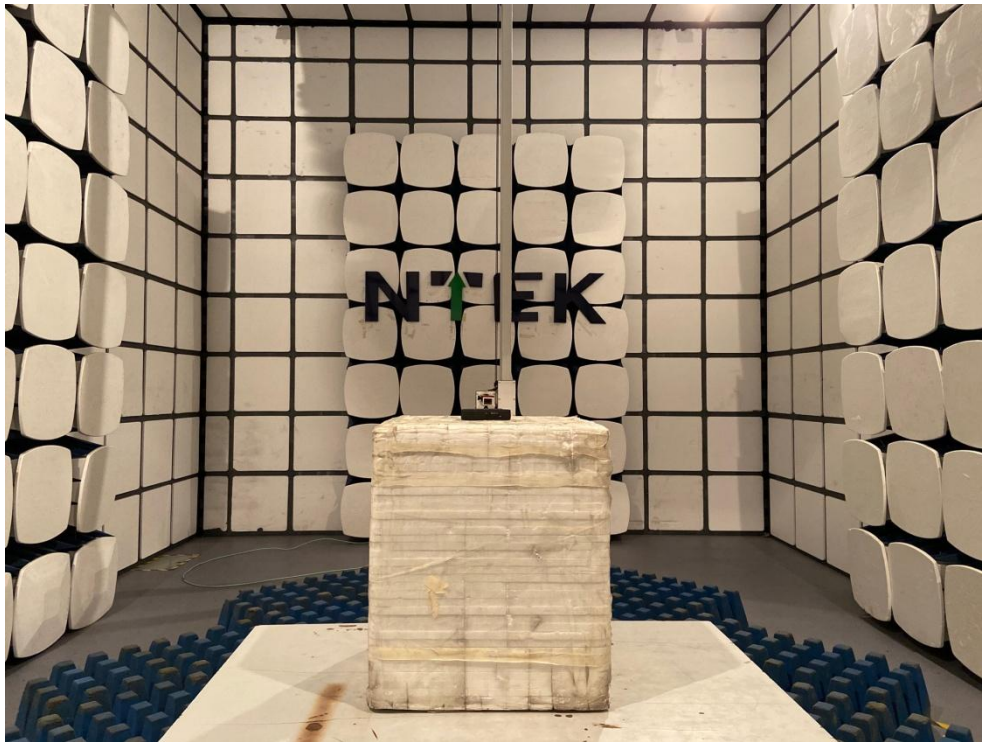
AC Conducted Measurement Photos