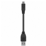
The charging cable