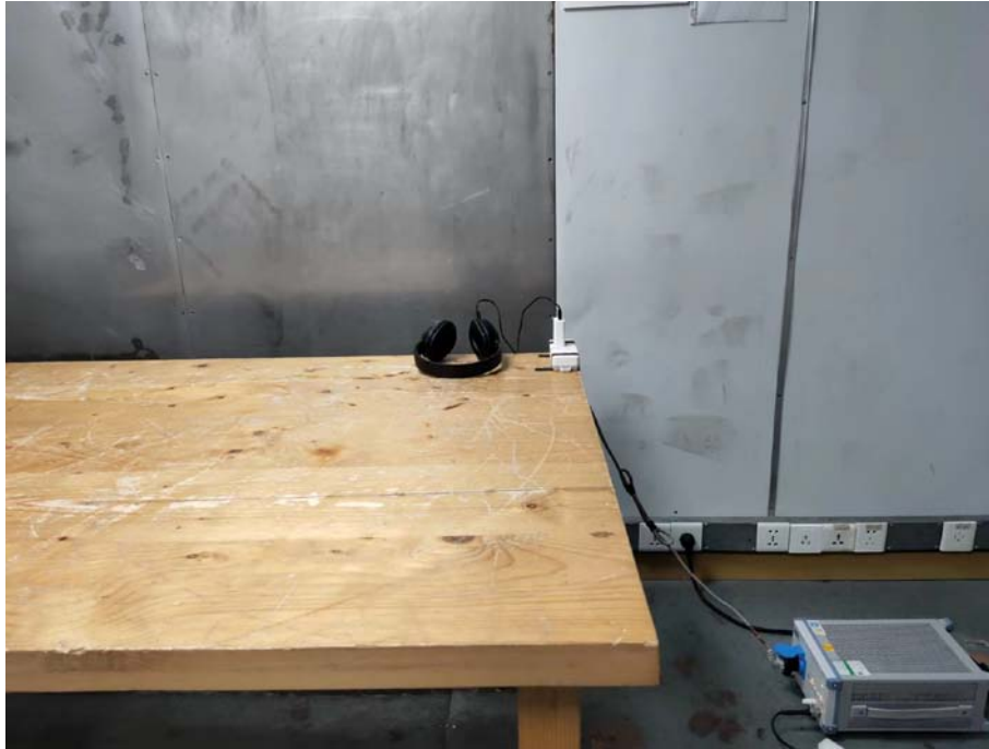
Photo of Power Line Conducted Emission Measurement