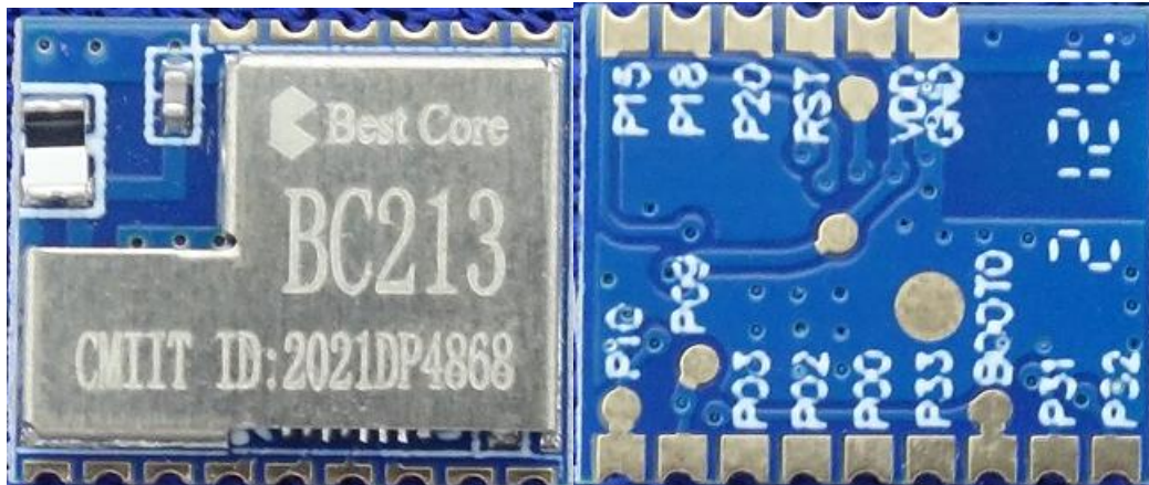
Fig. 1: Image of BC213