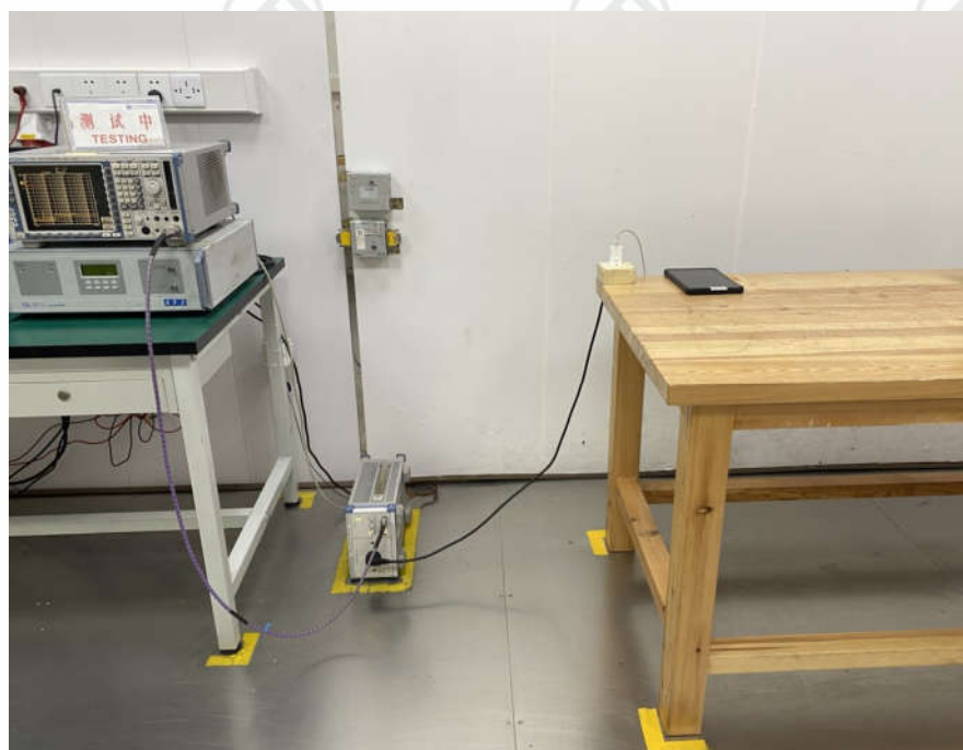
Conducted Emissions Test Setup