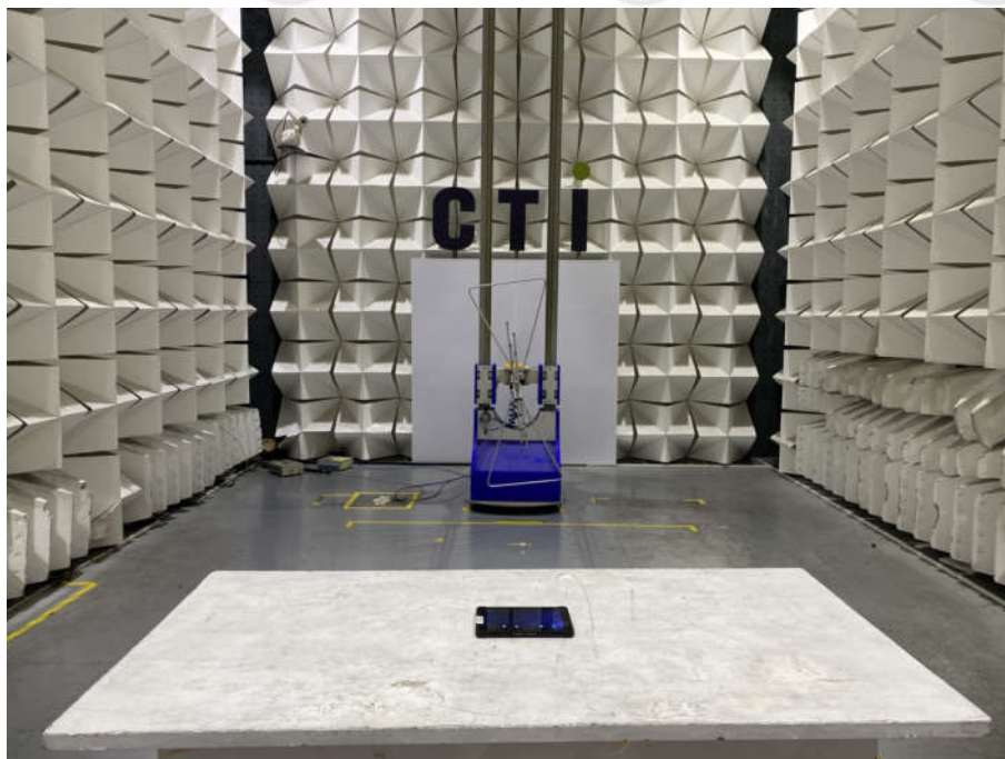
Radiated spurious emission Test Setup-1(Below 1GHz)