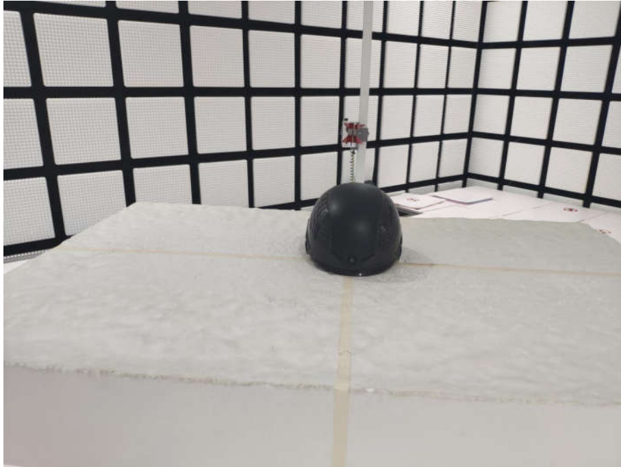
Radiated spurious emission Test Setup-3(Above 1GHz)