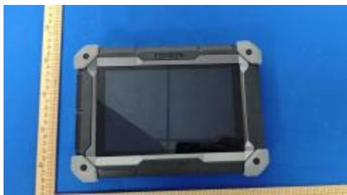
Phoenix Lite 3 (New added model)