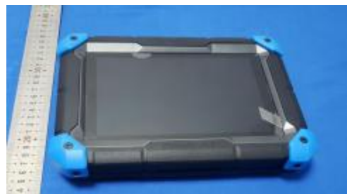
Phoenix Lite 2 (Original model)