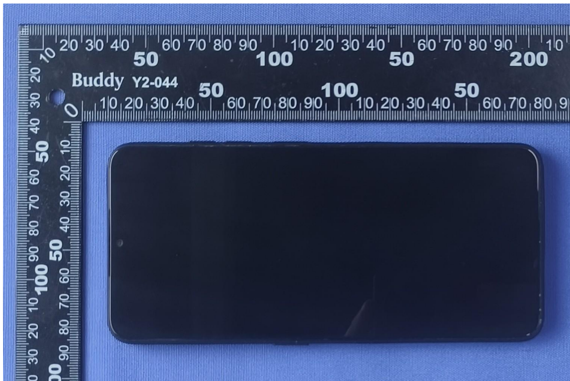
Pic D-1 EUT (Front Side)