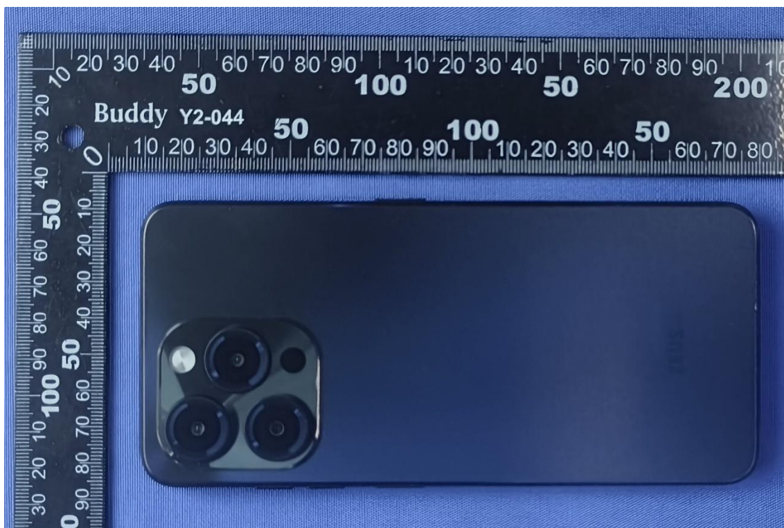
Pic D-2 EUT (Rear Side)