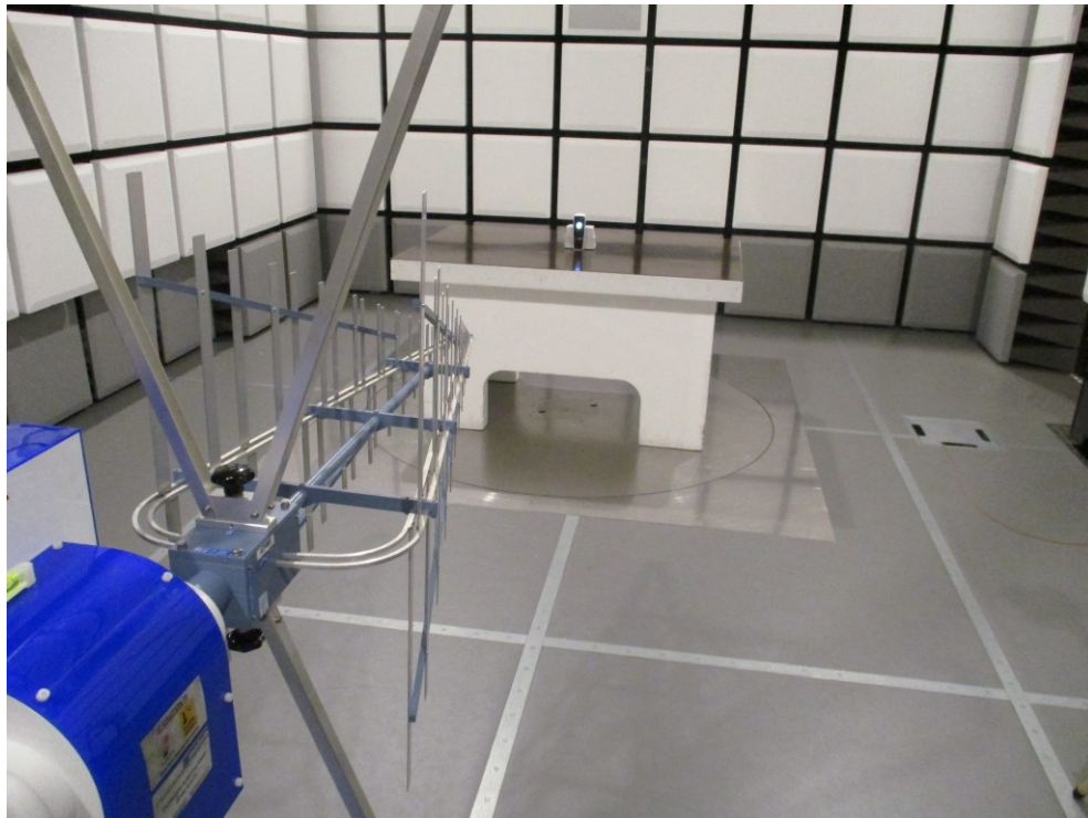
Figure 3: Radiated emission test from 200 MHz to 1 GHz