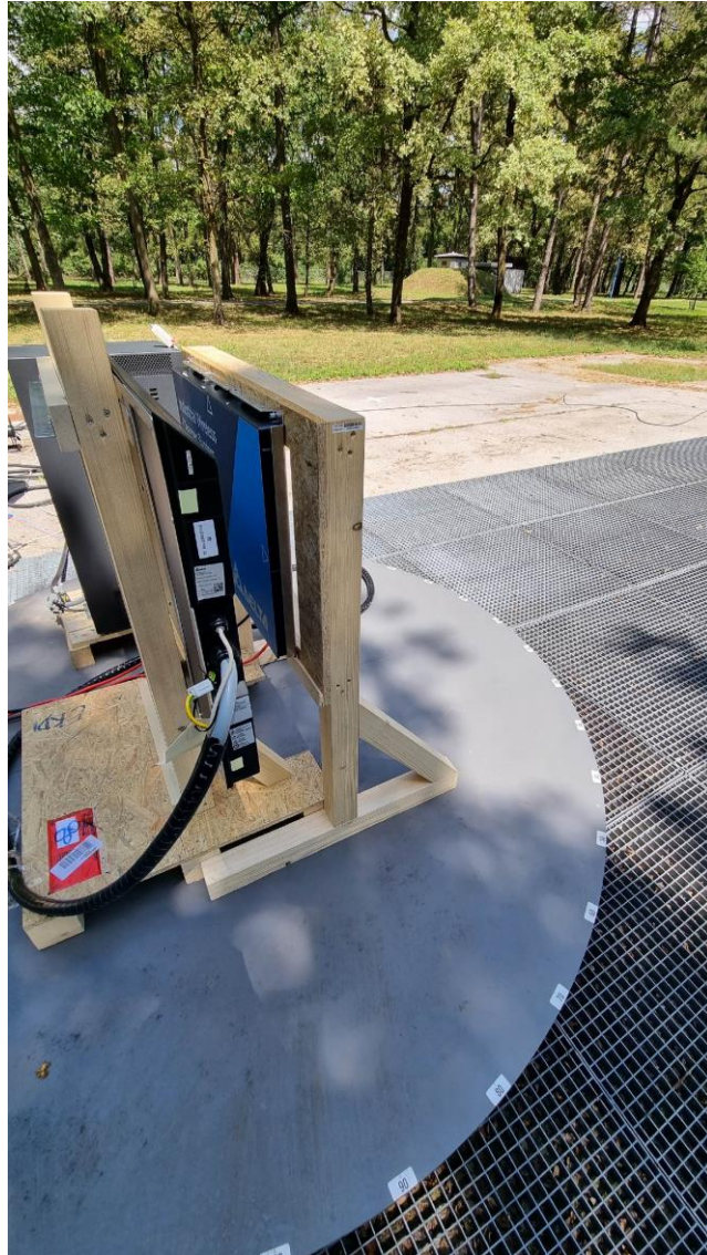
Figure 7: OATS testing 9 kHz-30 MHz