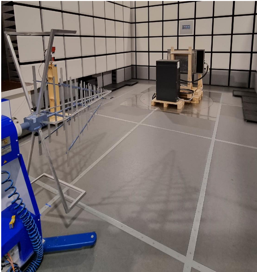
Figure 6: Radiated measurements 30 MHz-1000 MHz