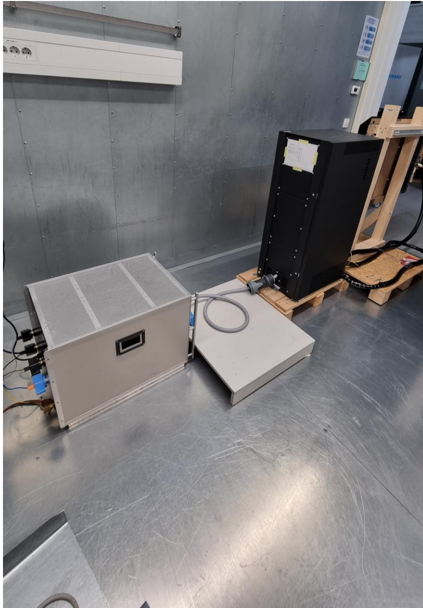
Figure 1: Conducted emission test