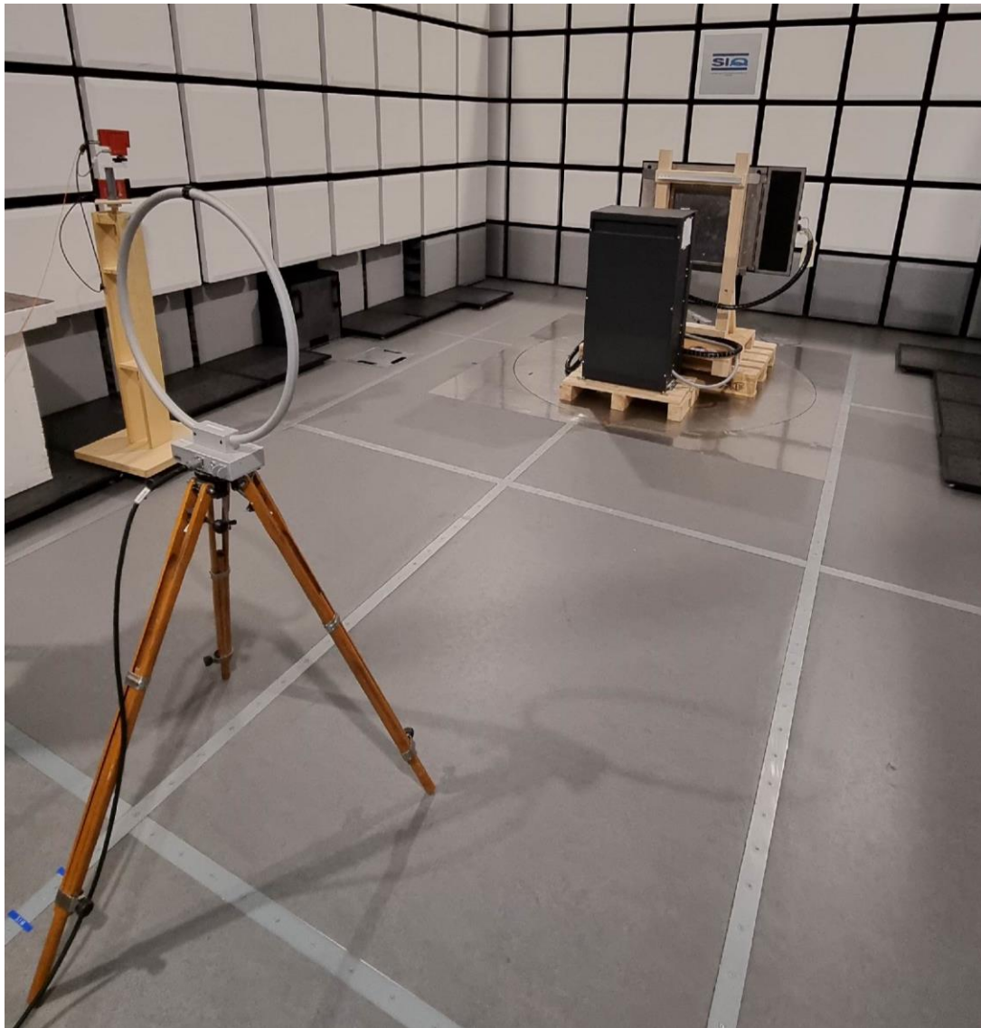
Figure 2: Radiated measurements 9 kHz-30 MHz