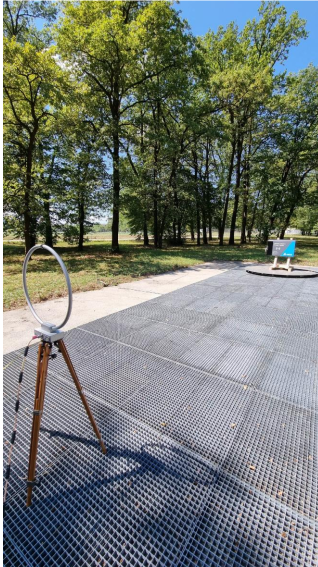
Figure 4: OATS testing 9 kHz-30 MHz