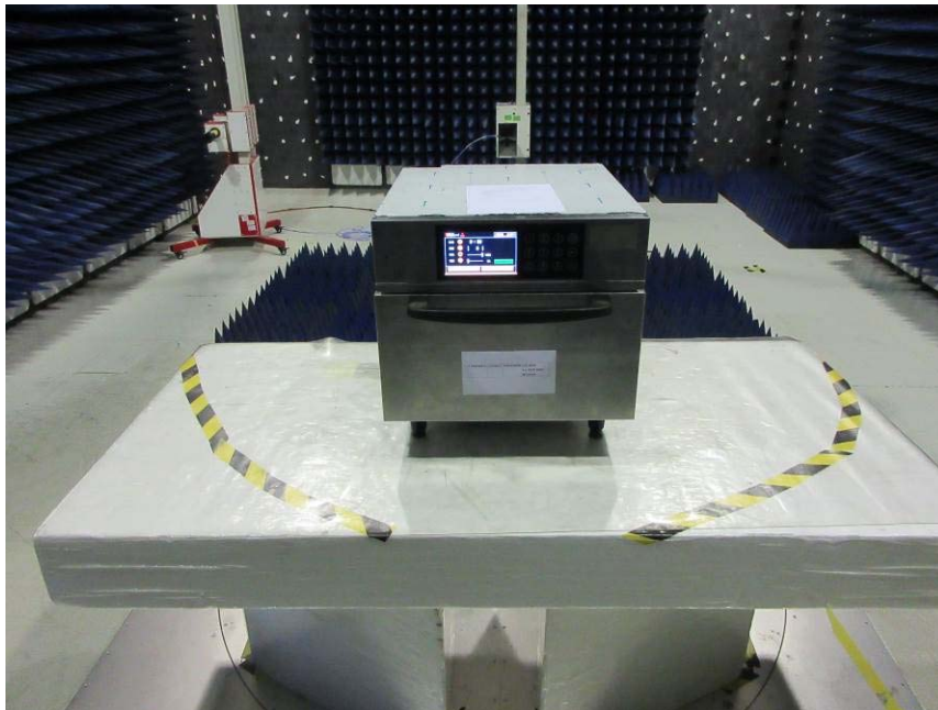
Radiated Disturbance above 9KHz-30MHz