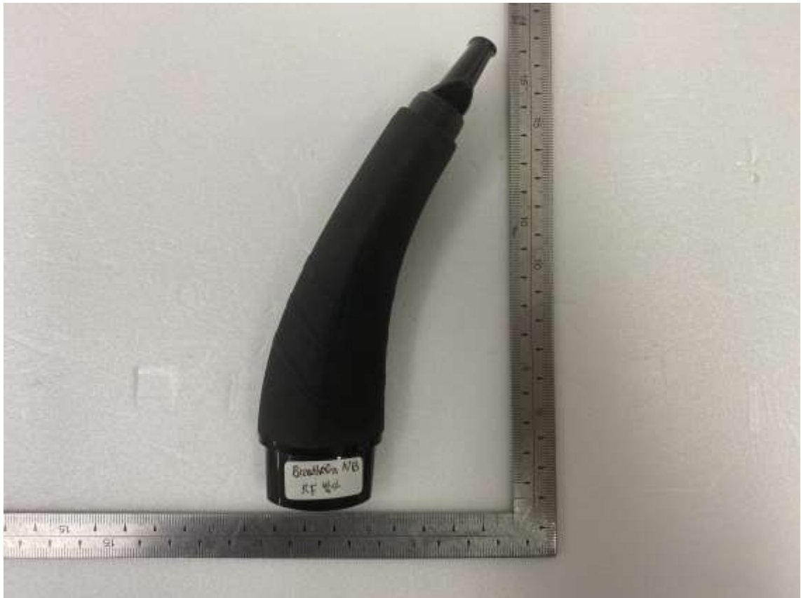
[External Photo of Basic Model: Breathe-On(NB)]